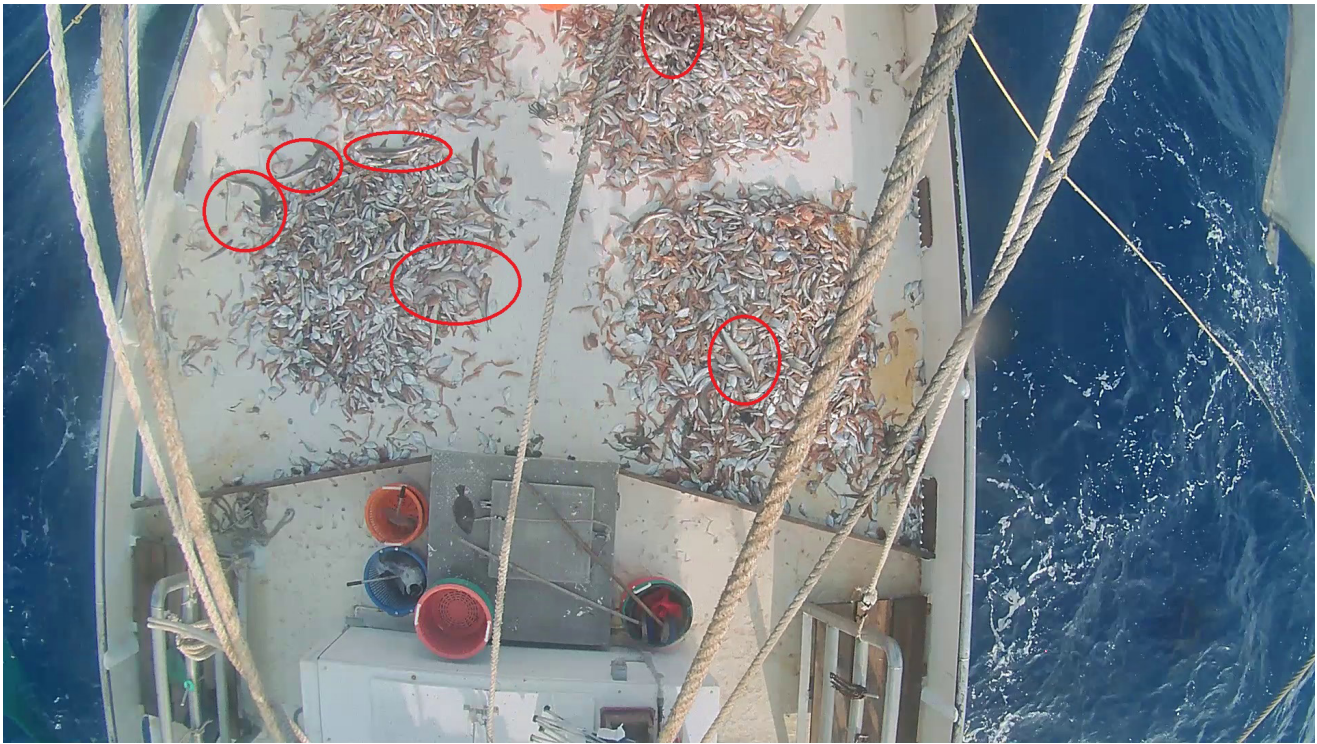
Figure 2.—Sharks documented with the EM system.

system performance issue of the study occurred during this trip, with a single camera having intermittent connectivity issues due to a damaged wire, which was fixed when the vessel returned to the dock. Since the electronic data was lost, we were not able to evaluate the impact this performance issue had on the data collection process. This occurrence shows a serious weakness of EM data collection, and future work would need to address this source of loss, whether it is electronic submission of the data while in port or duplication of hard drive data prior to shipping.