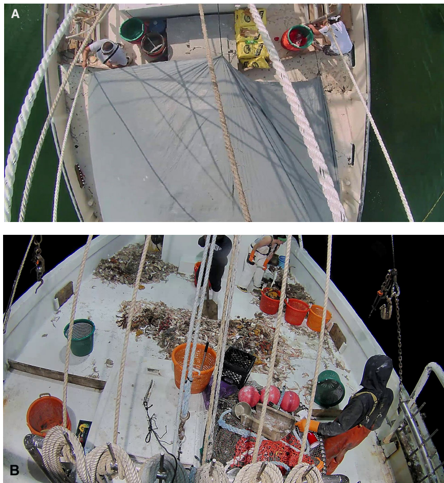
Figure 3.—Deck of vessel with A) tarp covering deck during sorting, inhibiting view, and B) adjusted view to prevent tarp from obscuring images.

It is most beneficial to an EM program that video reviewers are current or former observers for that specific fishery, as they will be the most familiar with the practices and species encountered of that fishery (Chavance et