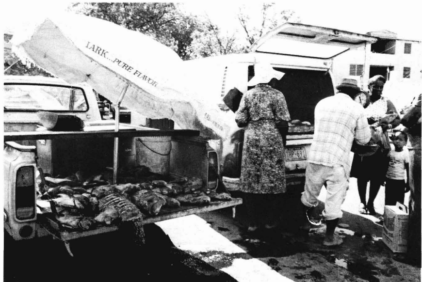
Figure 1.— Virgin Islands fishermen generally spend as much as one-third of their time marketing their catch on the street.

Fishing was undertaken from two boats. The first was a 12-year-old, 20 foot \times 5