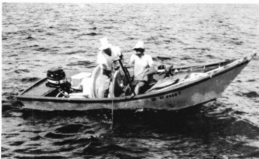
Figure 2.—Hauling fish traps by hand from project dory. Hydraulic net hauling equipment can be seen behind fisherman on the left of the photograph.

a) Gill nets were set on the bottom and around schools of jacks and tunas. b) haul seines were set around schools of jacks and tunas, and c) trammel nets were set on the bottom in likely locations for reef fish.