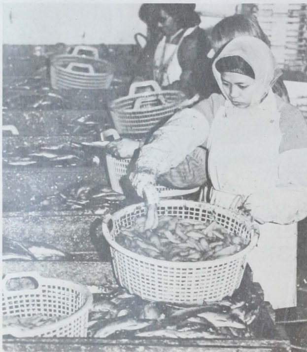
Fig. 3 - "Gibbers"--women who remove the herring roe--work on a piecemeal basis. In this Sitka, Alaska, processing plant, they earn $28 to $45 a day.