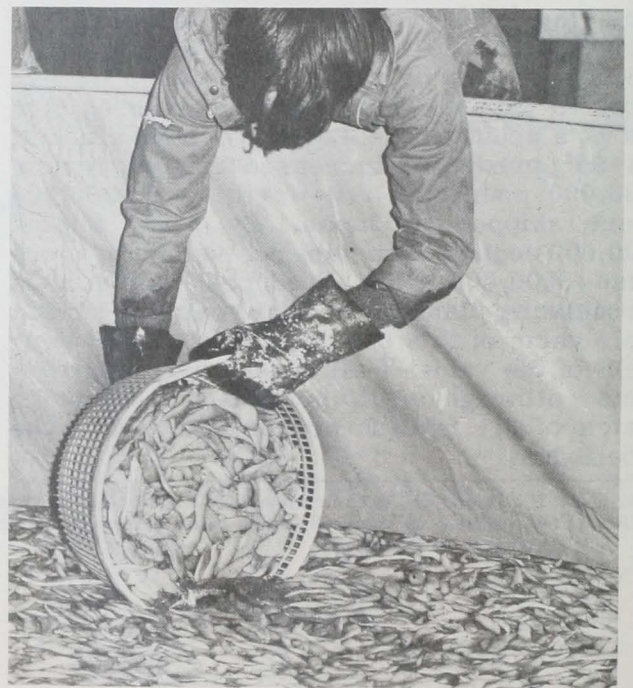
Fig. 4 - Basket of herring roe is put into a brine solution. During processing, roe is placed for 12 hours in each of three different brine solutions with a 3- to 6-hour drain period between each soak. The first two solutions have a salt content equivalent to sea water, the last a 100% solution of salt.