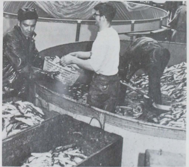
Fig. 1 - Herring used in roe processing are aged in an open-top tank for 5 to 7 days. Herring are being transferred from aging tank to containers for transfer to processing plant.

Note: Herring roe production reportedly is "big" this season in the Kenai Peninsula area. About 1,500 tons of herring were caught in Kachemak Bay and Resurrection Bay; processors in Seward and Homer are swamped. Herring roe is being processed in Anchorage for the first time. Some of the larger plants are employing more than 90 employees in this presalmon-season venture. For Alaskans, this fishery has been increasingly profitable. In 1969, fishermen were making as much as $10,000 a vessel at prices of $40 a ton.