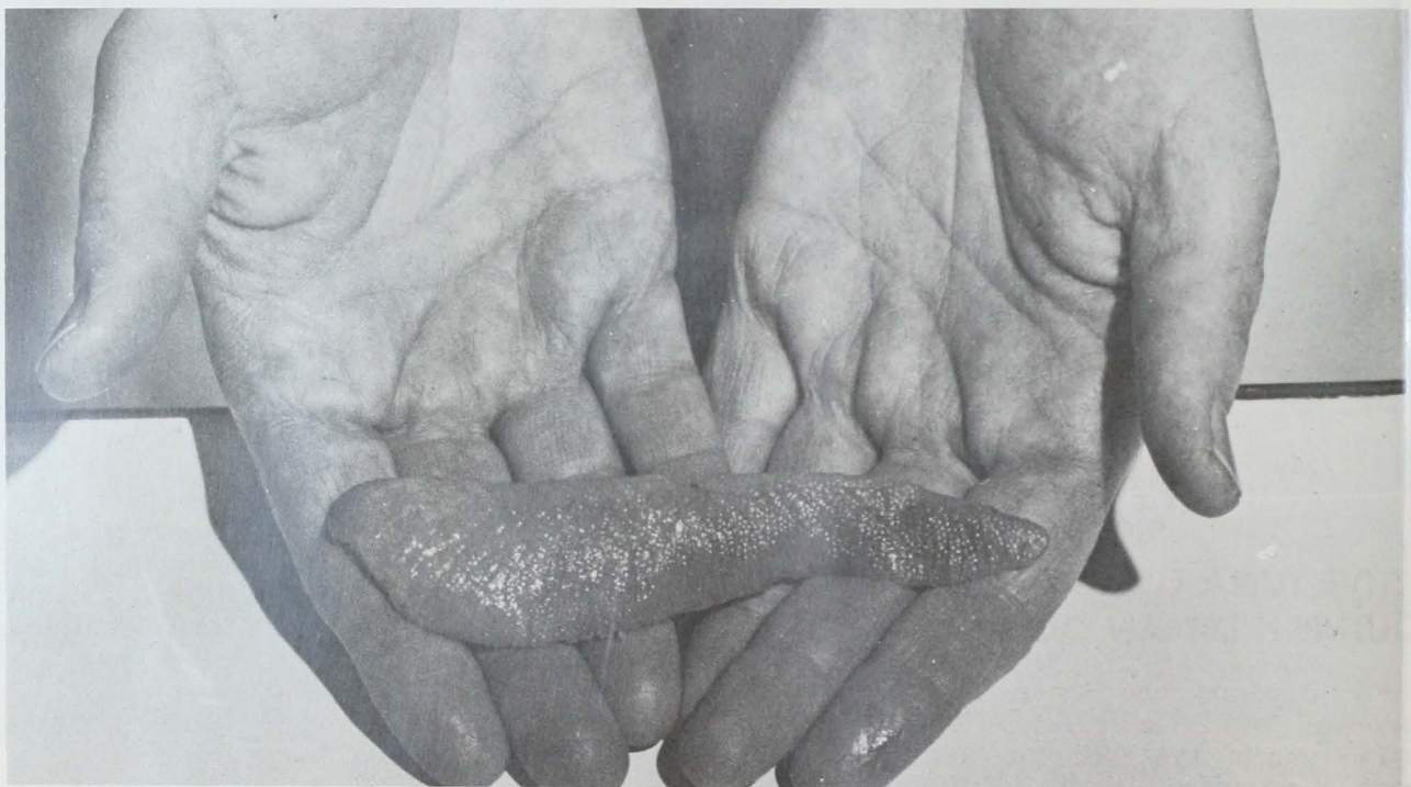
Fig. 9 - Herring roe, a delicacy in Japan, sometimes brings $7 a pound retail.