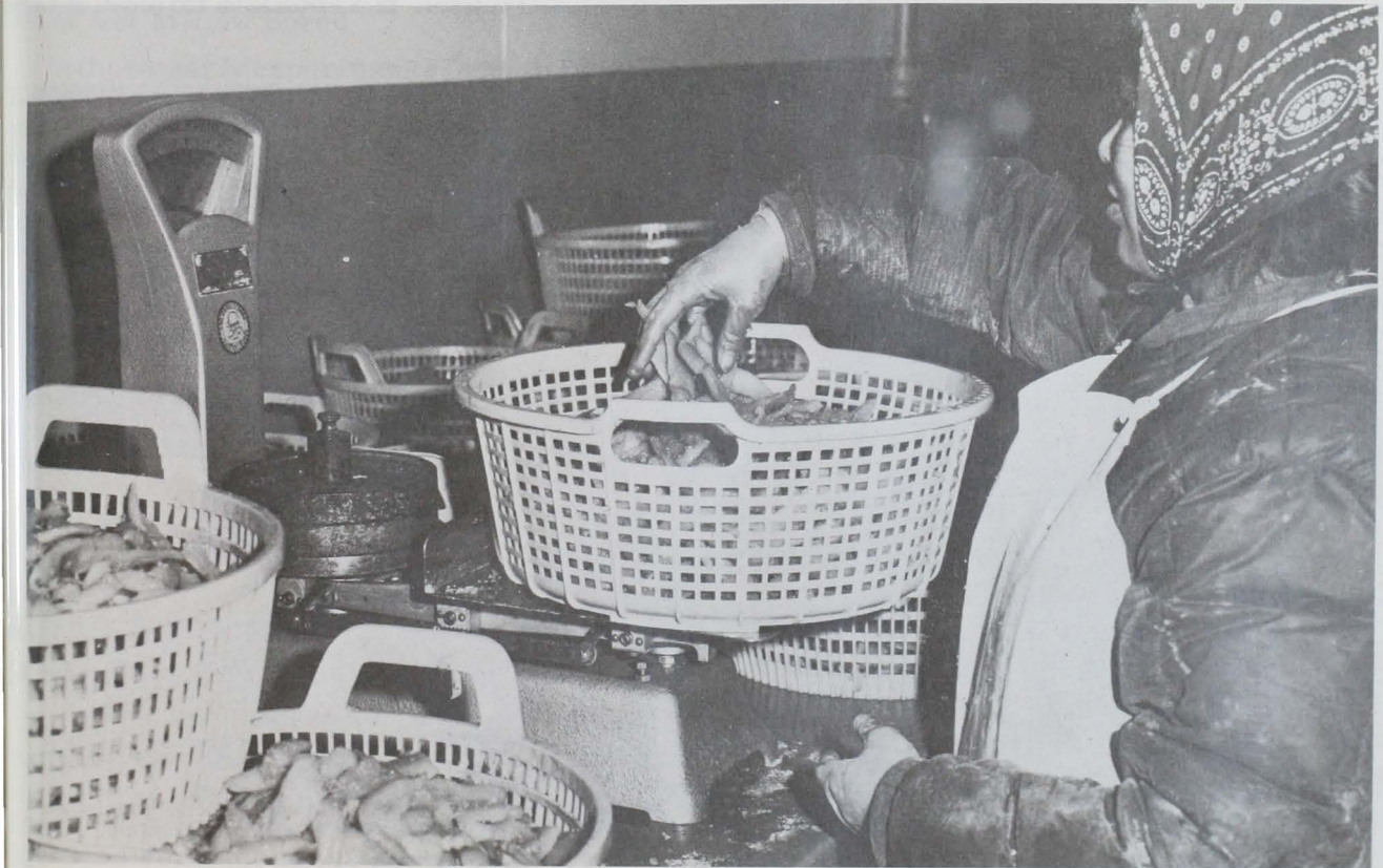
Fig. 7 - Herring roe in baskets are weighed before they are packed in cartons.