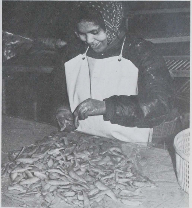
Fig. 6 - Broken and discolored skeins of herring roe are removed during final inspection.