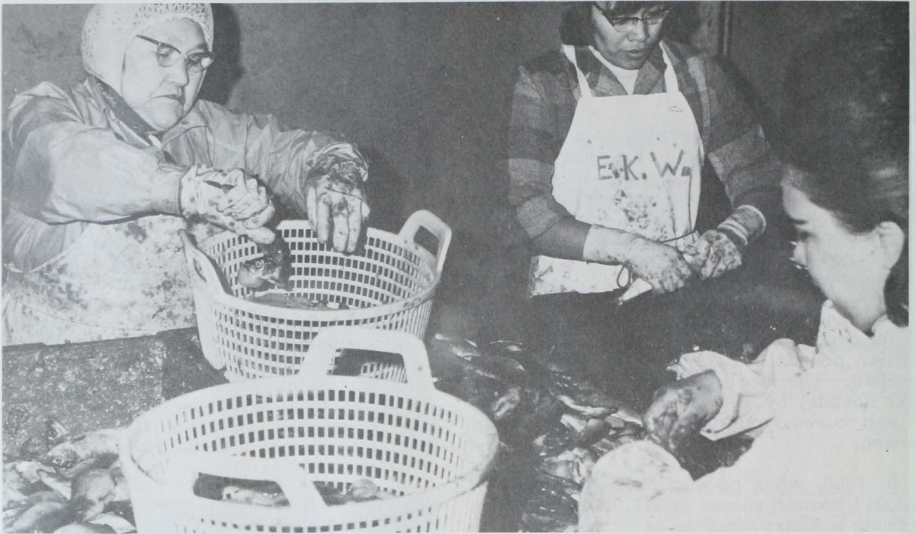
Fig. 2 - Herring roe is removed from the "aged" herring by first breaking the fish just behind the head, then using a squeeze-shake action to extract the roe from the carcass (woman on left). The ripeness of fish when caught is critical because seasonal maturity greatly influences both processing efficiency in removing roe and final quality of roe product. The amount of roe recovered from amount of herring landed is 8% to 10% by weight.