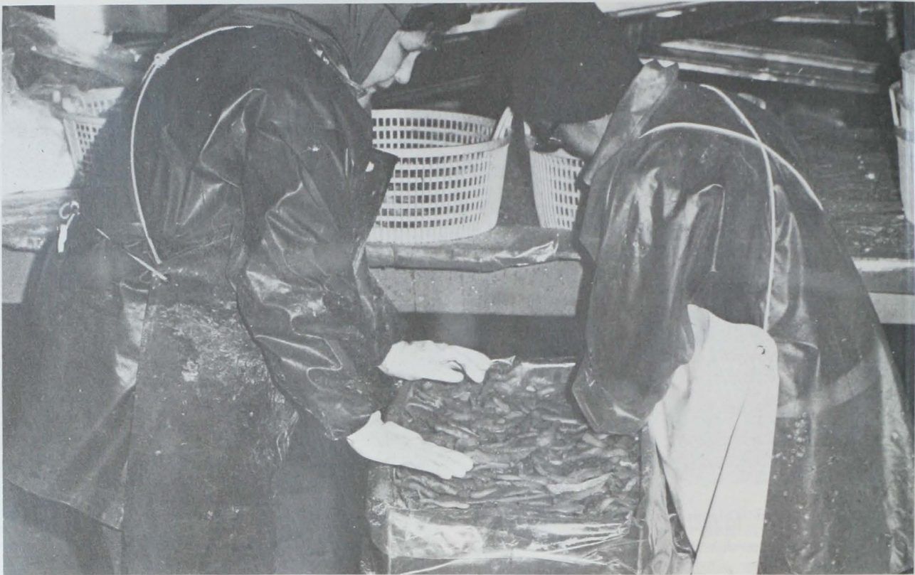
Fig. 8 - Cured herring roe is packed in plastic-lined, heavy-duty cartons for shipment to Japan. Each carton holds 120 pounds of herring roe and 18 pounds of dry salt.