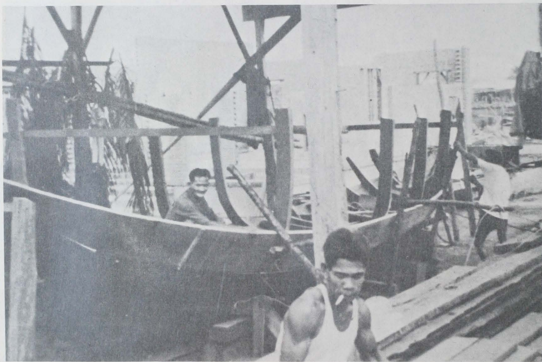
Fig. 7 - Typical construction methods for popular type of fishing boat (Phan Thiet).