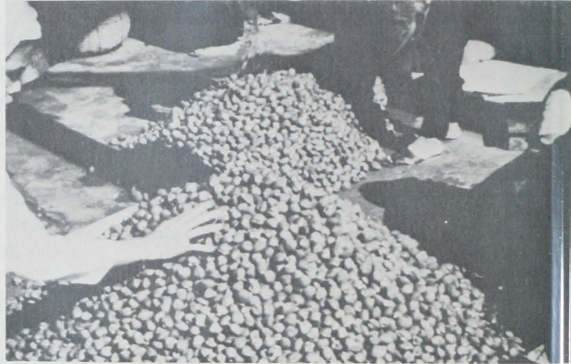
Fig. 2 - Clams for sale.