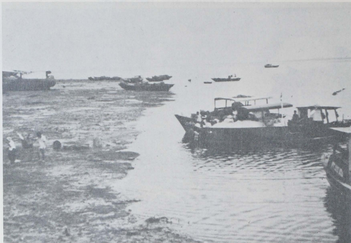
Fig. 6 - A Fishery Problem: Unloading fish by hand at low tide (Vung Tau).