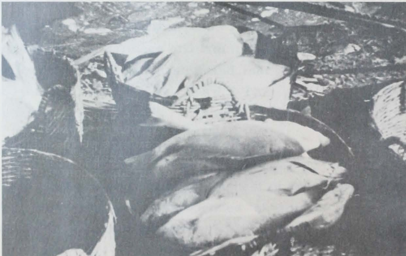
Fig. 3 - Red Snappers.