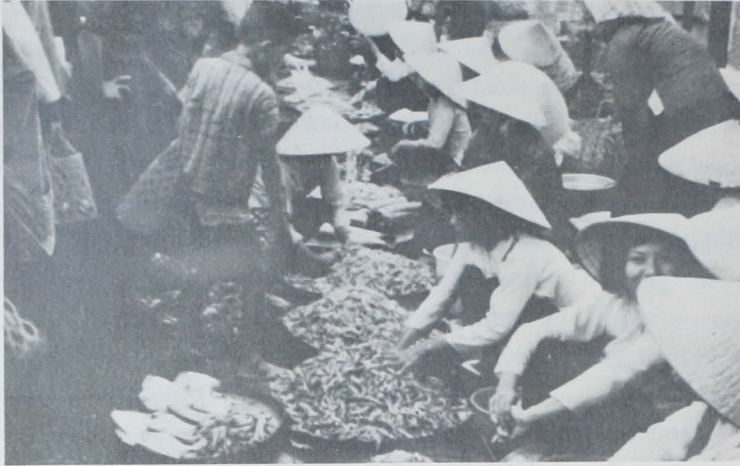
Fig. 1 - Shrimp Sellers.