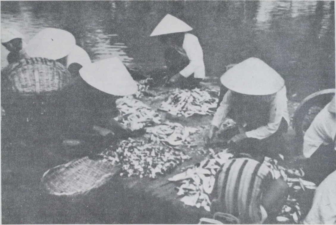
Fig. 4 - Preparing fish for Nouc Nam (fish sauce).