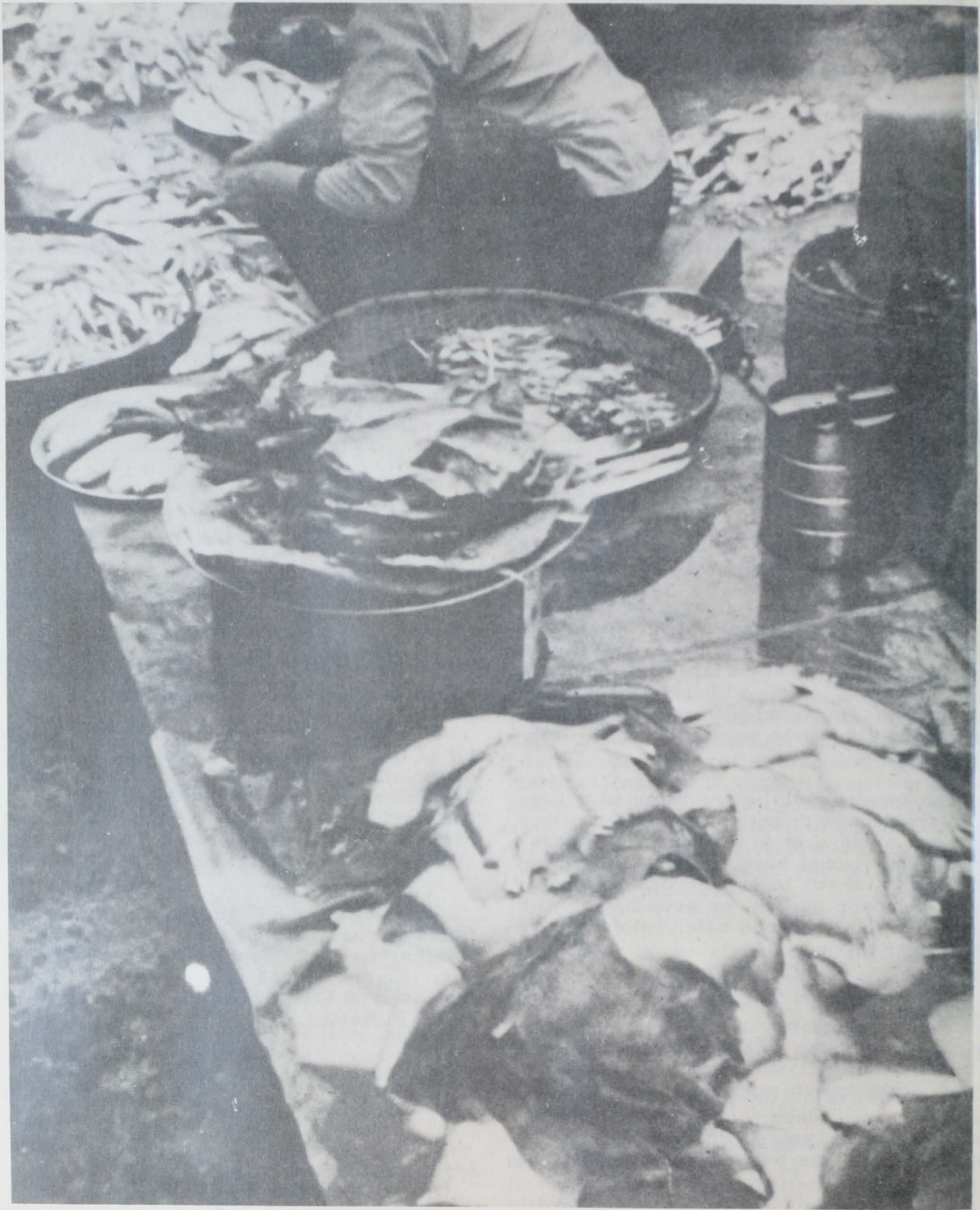
Market place of Rach Gia, S. Vietnam, major fishing port on Gulf of Thailand.