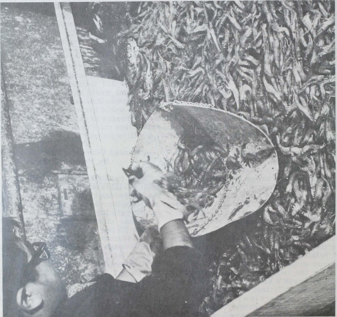
"Clean" catch consisting predominantly of pink shrimp.