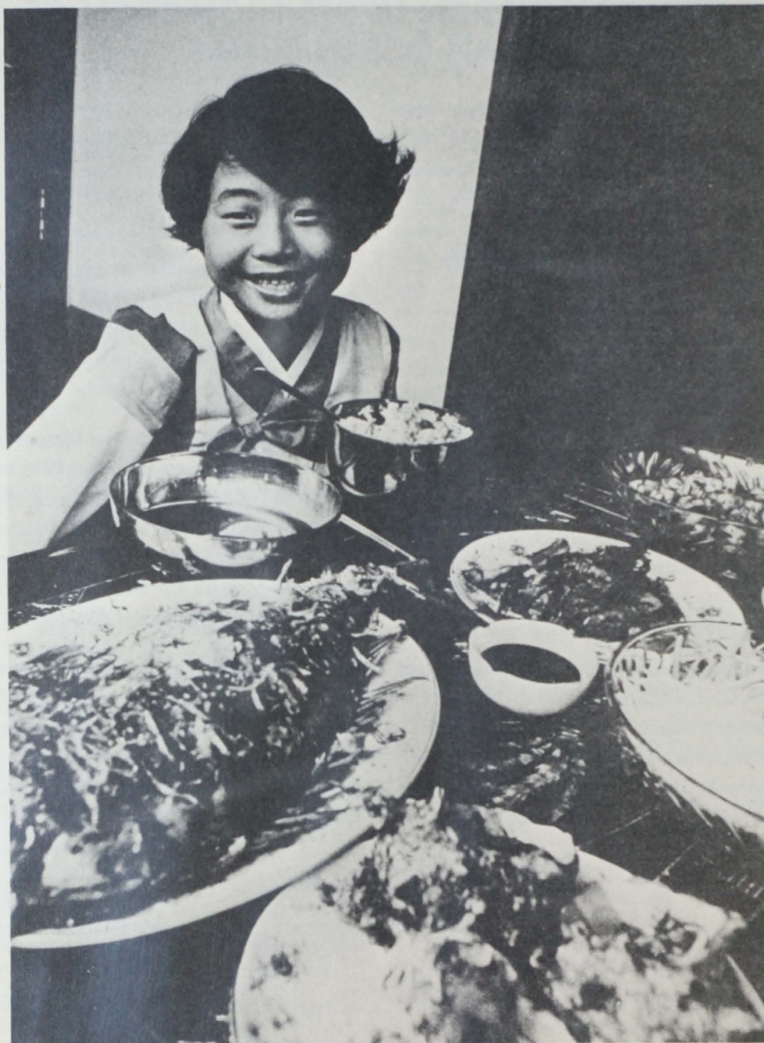
A Korean child enjoys seafood meal.