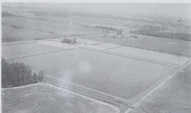
Fig. 2 - Catfish farms now form geometric patterns across the Southern United States.