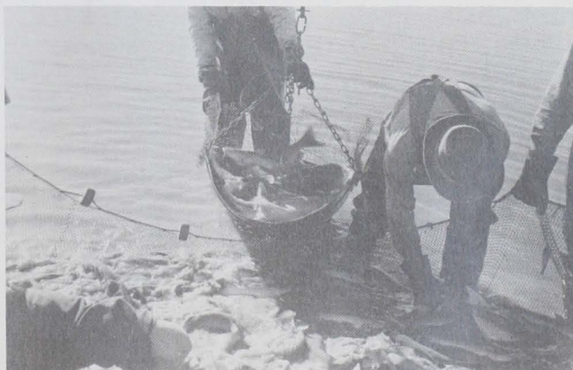
Fig. 3 - Everyone wades in to load catch after BCF biologists give a catfish-harvesting demonstration. At Bureau's Gear Research Base in Kelso, Arkansas, biologists are searching for quicker, more efficient methods of harvesting.