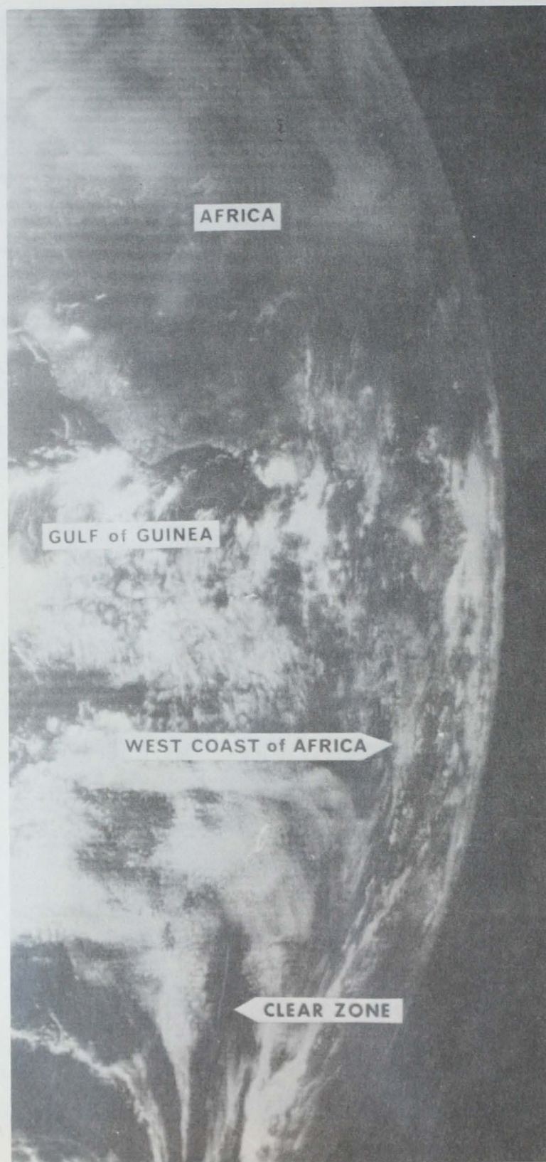
Fig. 3 - ATS III TV-picture showing clear zone extending along the west African coastline from Cape Frio to Capetown.