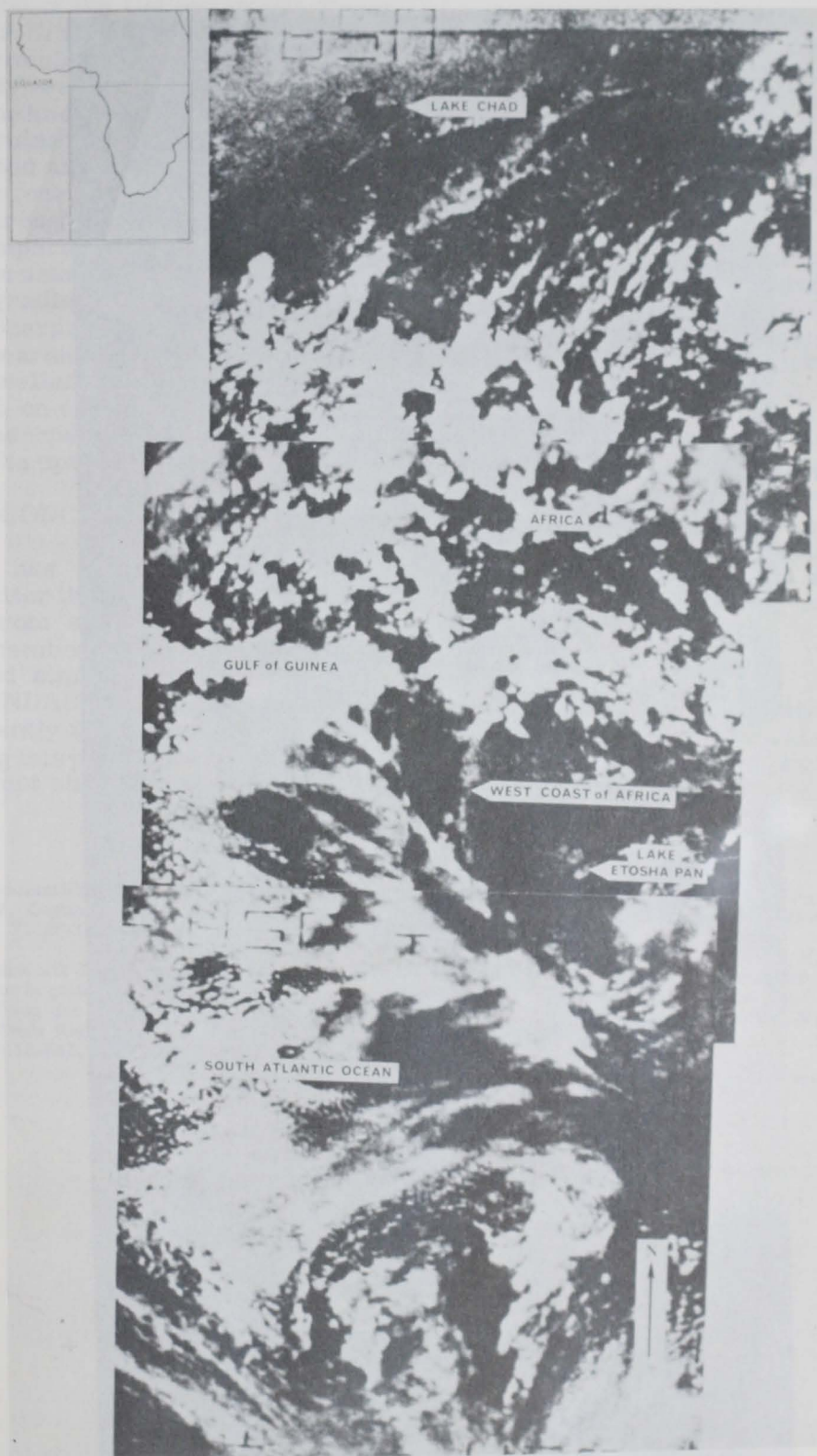
Fig. 2 - Mosaic of typical ESSA-6 weather satellite TV-pictures received during UNDAUNTED Cruise 6802 showing important geographical features. Dark swath on outline map shows surface area covered by mosaic.