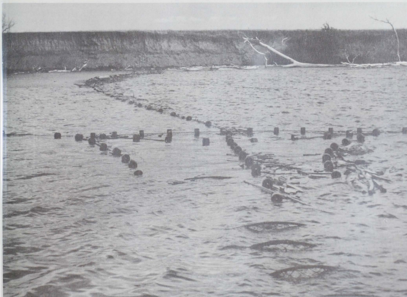
Fig. 2 - Floating trap net in fishing position on Oahe Reservoir, S. Dak. In this set the lead extends to shore. Note floating debris--a common problem on this newly formed reservoir.

"openwater" sets also are practical. The net is set by fastening the tag end of the lead to shore, stretching the lead and net out longitudinally, anchoring the crib, and then anchoring the wings in position. The crib anchor rope is 100 feet long and the wing anchor ropes are 50 feet long. The wing anchor ropes are yoked about 30 feet from the anchor with one line leading to the bottom line and the other to the float line. The gear has not been fished on the bottom, but this could be done by a change in the float-lead ratio. We recommend that the net, as now rigged, not be set in water depths over 30 feet. To fish depths greater than 30 feet would require anchor lines longer than those used at present to prevent excessive downward pull that would cause disfiguration of the net or submergence of float lines. The weight of longer anchor lines would probably require more floats at the wing and lead tips, and on the crib section.