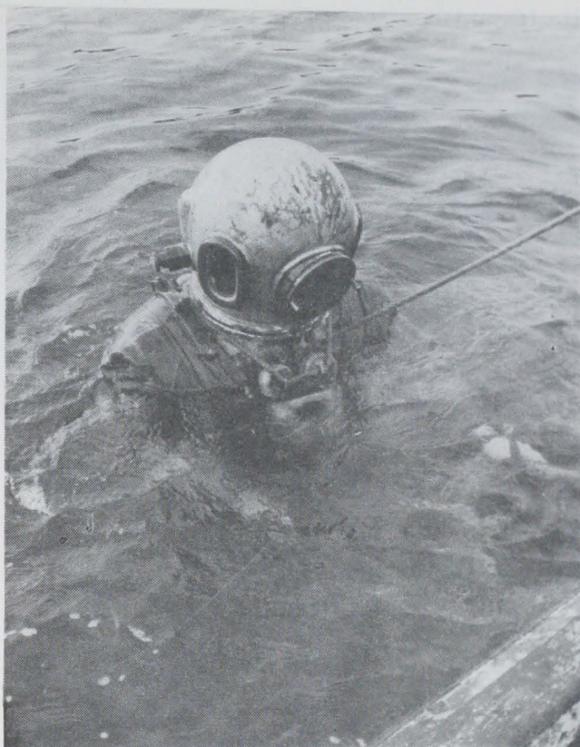
Fig. 1 - Diver collecting oysters in waters off Southern Chile. They are so plentiful that diver can fill a basket in a few minutes.

The Committee has donated diving suits for the oyster fishermen and has studied the possibility of erecting salting and drying sheds and an ice plant. The difficulties in carrying out any ambitious crash programs are in some ways peculiar to the region in that the region owes its rich sea life to its remoteness and the corresponding near-impossibility of getting fish to any sizable market. Drying sheds, or tunnels, for instance, are not needed primarily to reduce the fish's weight for shipping--not to conserve fish, which can be done almost as effectively with salt.