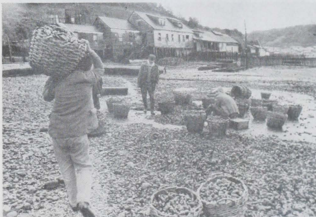
Fig. 2 - Shellfish are held in the recurring tides to keep them alive before they are marketed by a fishermen's cooperative in Southern Chile.