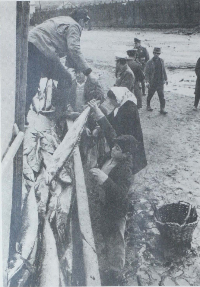
Fig. 3 - Fisherman of Southern Chile selling his catch directly from his boat at low tide.

coast of Latin America--in Chile, Peru, and Ecuador--one-fifth of the people's total animal protein consumption comes from fish. In Ecuador, 40 percent more than the present meat production would be necessary to replace fish consumption--and this is considered far too little. Preserving and shipping fish for human food from the one region in western Latin America with a great supply can have important long-range effects.