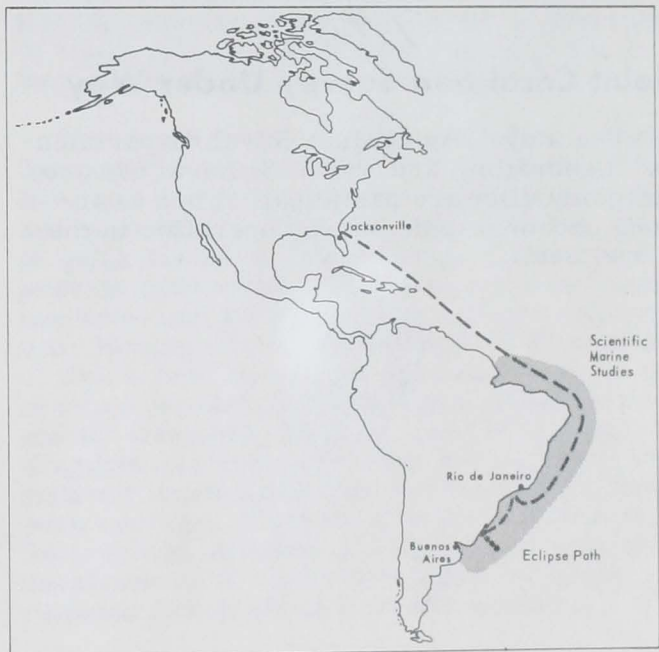
Oceanographic track of the trip of the Oceanographer which was designated "Operation Eclipse".

The 303-foot, 3,800-ton, $9.2 million air-conditioned vessel is the largest and most completely automated oceanographic research vessel in the United States. It will conduct a wide range of marine scientific studies off the east coast of South America and participate in observations of a total eclipse of the sun on November 12.