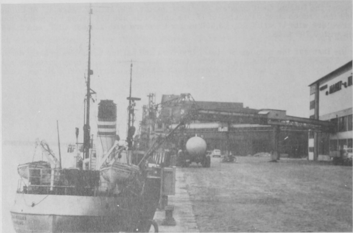
Fig. 4 - German distant-water trawler tied up at dock, Hamburg. Note overhead ice conveyor for icing-up vessels.

trawlers, motor luggers, and motor cutters. A number of the vessels--mostly the smaller ones--are also registered for inshore fisheries and fisheries in Lake Ijssel. Also, there are motor boats, sailing boats, and row boats which almost exclusively operate in the inshore fisheries.