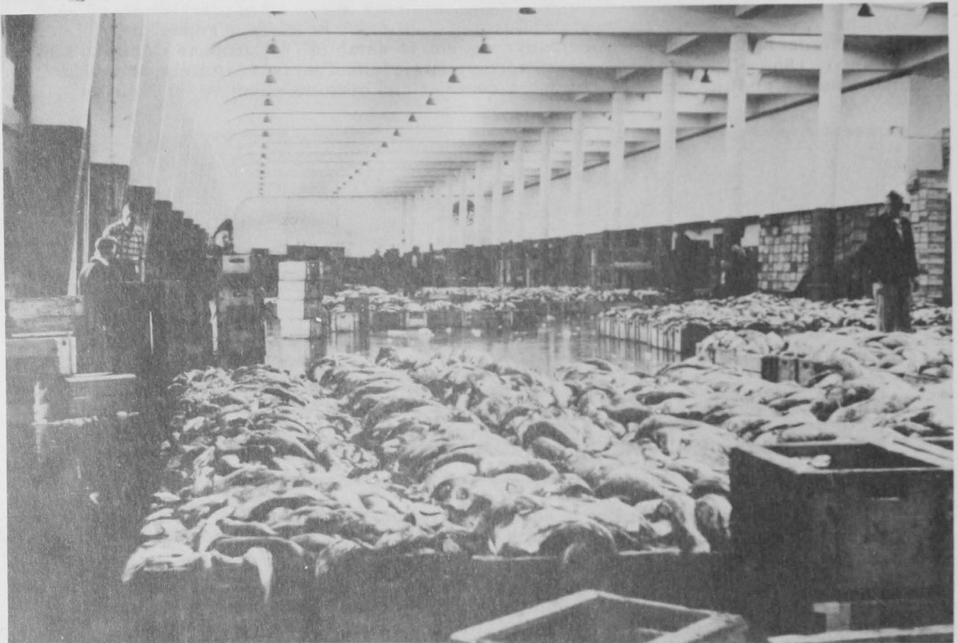
Fig. 2 - The fish auction, IJmuiden, Netherlands.

But the fishing fleets of the Common Market Countries vary widely, and not all craft or all categories of vessels are of the same importance.