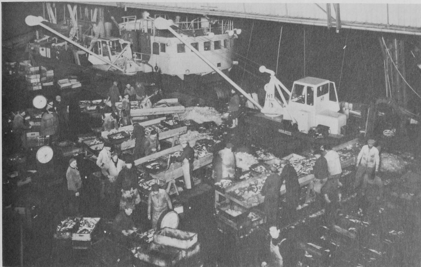
Fig. 3 - Unloading and boxing of fish at Boulogne, France.

Since the last war the number of steam trawlers and sailing boats has greatly decreased in France. The motor trawlers, on the other hand, have increased in tonnage as well as in horsepower. Recently the building of larger vessels has been strongly stimulated in France.