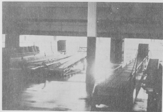
Fig. 8 - Conveyors used for unloading herring from fishing vessels at Hamburg-Altona fish harbor.

Of the Common Market Countries, the two most important producing countries of roundfish are West Germany and France. For the years 1954-58, Germany supplied 48.3 percent of the large roundfish and 44.1 percent of the small roundfish landed in Common Market Countries. France supplied 35.7 percent of the large roundfish and 31.2 percent of the small roundfish. Fresh herring is mainly landed by West Germany; between 1954 and 1958 the West German landings accounted for 68.0 percent of the total landings of herring in Common Market Countries, followed by France and the Netherlands.