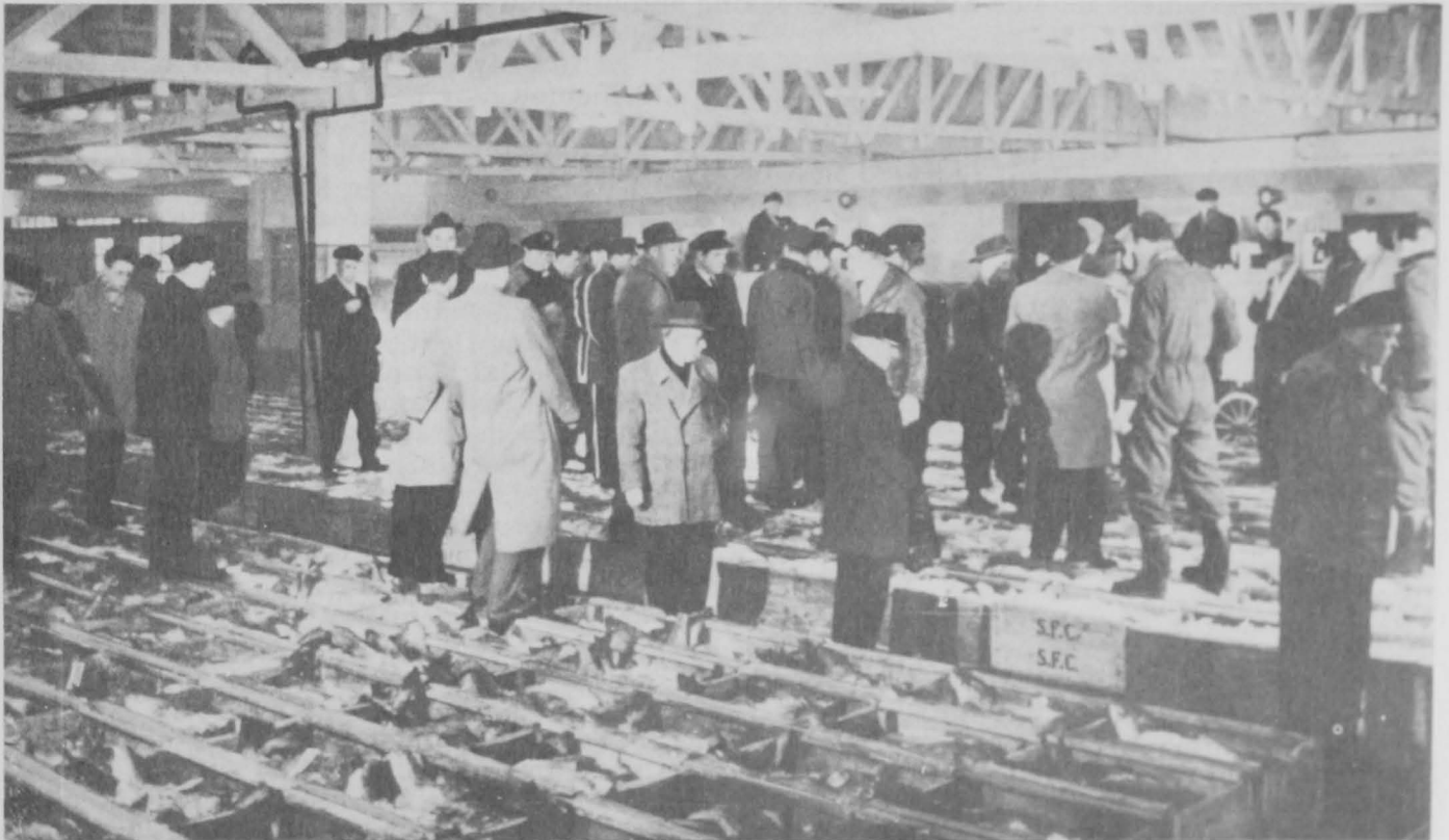
Fig. 6 - Fish auction at Cuxhaven, Germany

Generally speaking, the catching capacity of the fishing fleet in the Common Market Countries is now greater than before the war and continues to increase. Larger and faster vessels are built, not only for distant-water fisheries, but also for near- and middle-water fisheries. At the same time, the vessels are equipped with modern navigational aids.