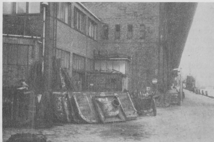
Fig. 9 - Trawl doors and other vessel supplies on dock at Hamburg.

About 60 percent of the exports of the Common Market Countries are destined for member countries and about 40 percent to other countries. Belgium sells 64.1 percent of her exports to the Common Market. France is the most important market for Belgium (especially for fresh fish). France exports 32.7 percent to member countries, with Italy her best customer. Italy is not important as an exporter. The Netherlands, on the contrary, sells more than 71.0 percent of her exports to member countries. Her principal markets are Belgium, France, West Germany, and Italy. West Germany has an outlet in the Common Market for about 49.2 percent of her exports, and her best customers are Italy and France. As an outlet for sea products, nonmember countries are important to Italy, France, and West Germany.