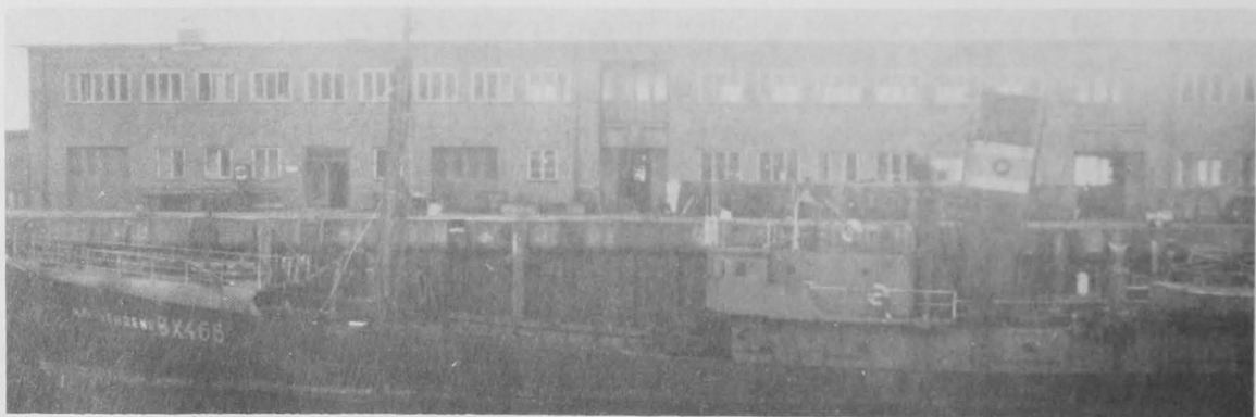
Fig. 5 - Lugger-type trawler, engaged principally in fishing for North Sea herring docked at Hamburg.

In West Germany the fishing fleet consists of trawlers, luggers, cutters, and open boats without motors. At the beginning of 1958, the German fishing fleet numbered 3,429 units, of