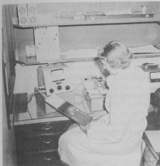
Fig. 3 - Paper chromatography of fatty acids derived from fish oils and their quantitative measurement with a densitometer at Hormel Institute.

In a first approach to the problem, Dr. J. R. Chipault and his coworkers are studying the products formed in the oxidation of fish oils by air. The volatile odor components are being removed from oxidized oil and analyzed. This is not easy because the offensive volatile components, although possessing powerful odors, ordinarily are present only in very small amounts.