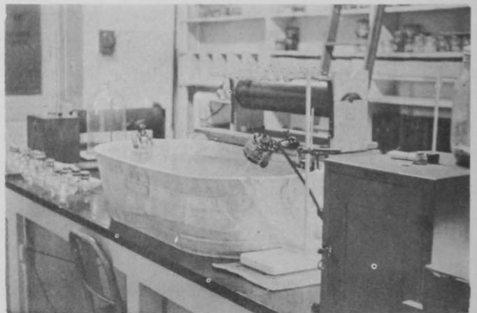
Fig. 2 - Water bath with temperature control and stirrer. The kymograph to the right is for recording shell movements of oysters under test for reaction to higher temperatures.

There is a positive correlation between the intensity of "brown-spottings" on the oyster body