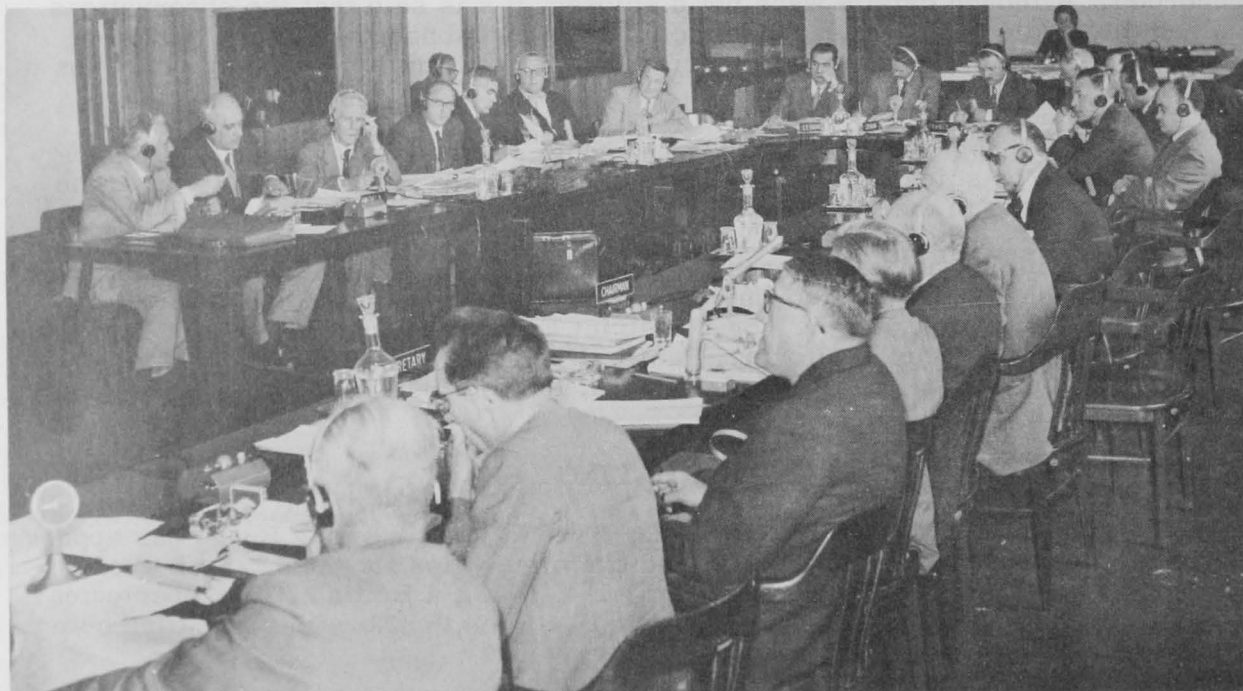
Technical Committee on Fisheries meeting. Representatives of 29 countries and an observer from UNESCO attended.

The Director of the Economics Division at the first meeting of the Commission-of-the-Whole on November 8 gave his statement on the "The World Food and Agricultural Situation" (Document C 55/CW/2). After referring to the printed document, the State of Food and Agriculture (C 55/4), which reviewed developments over the last decade, he pointed out that the present situation had not changed fundamentally since the 1953 Conference. Although there were some surpluses and stockpiles were growing, the per capita production of food in the world had not risen much because the purchasing power was not available.