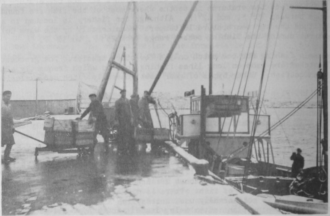
FIG. 2 - TRANSPORT VESSEL UNLOADING FISH AT FILLETING PLANT IN MELBU, NORWAY.

FILLETING PLANTS : There are between 27 and 30 filleting plants producing for the Association, depending on the time of season. These plants range from small