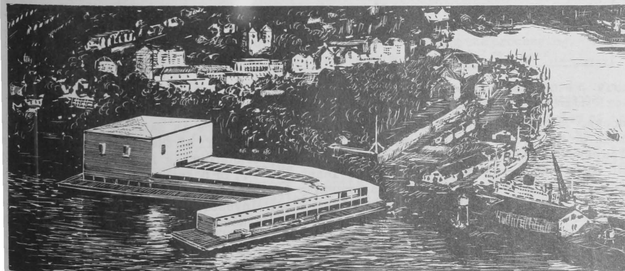
FIG. 4 - NEW 12,000-TON FREEZER AND COLD-STORAGE PLANT AT BERGEN, NORWAY. ARCADE LEADING TO THE MAIN STORAGE SECTION HOUSES THE PROCESSING ROOMS.

The cold-storage rooms used by most of the plants are of the usual design with coils and air-circulation system. The fillets are stored in master cartons and