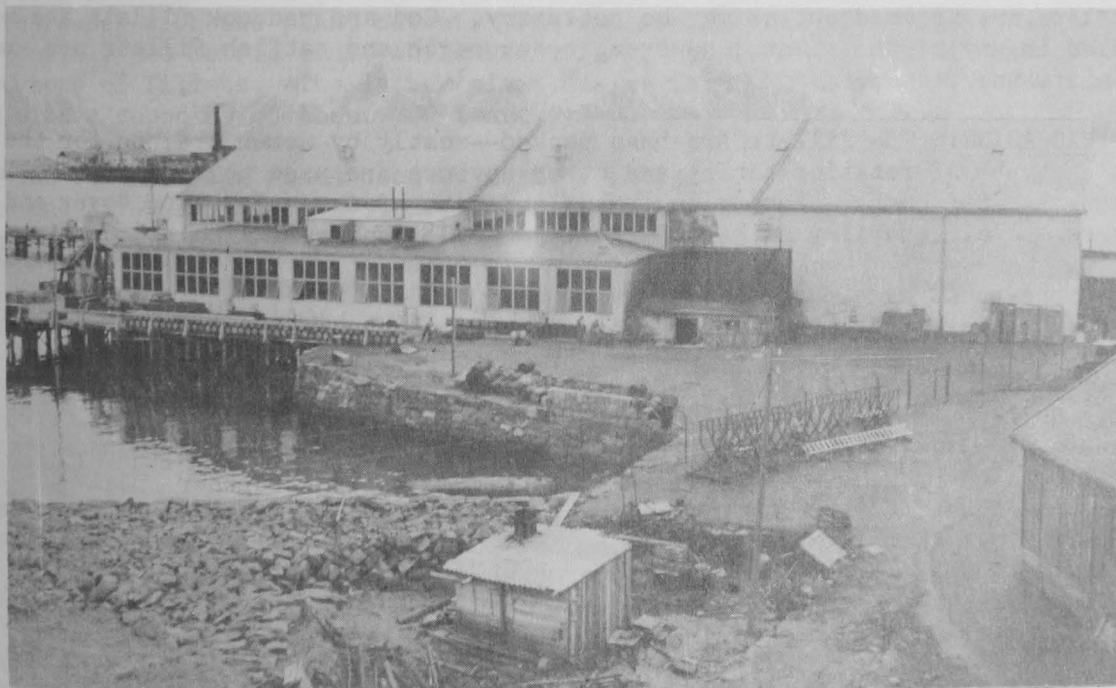
FIG. 3 - FILLETING PLANT AND FREEZER AT MELBU, NORWAY.

The percentage of recovery in filleting varies somewhat according to the size of the fish. Absolutely boneless, boneless, semi-boneless, and whole fillets are