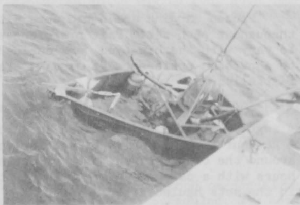
UNDERWATER CAMERA BEING LOWERED TO PHOTOGRAPH MARYLAND OYSTER BEDS IN CHESAPEAKE BAY.

The camera, developed by an Ardmore (Pennsylvania) firm, is a stereoptic device which photographs through a large pyramid of filtered sea water. It is operated from a crane and comes to rest near the bottom, at which time the flash takes place. From 3 to 5 minutes are required per picture. Development of the camera has been quite expensive, and operation costs in the field are high. Its use in Maryland to date, however, has been on an experimental basis with a prearranged sharing of the expense by the manufacturers and the Commission.