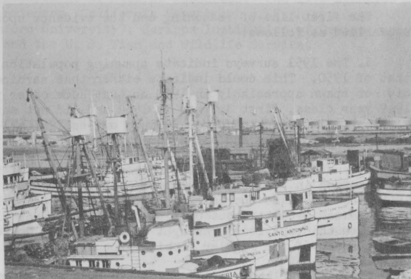
SARDINE PURSE SEINERS DOCKED AT SAN PEDRO, CALIFORNIA.

The Marine Research Committee directs the study of the sardine life history and oceanic conditions affecting the supply. The investigations are made by scientists from the California Academy of Sciences, Department of Fish and Game, Hopkins Marine Station of Stanford University, U. S. Fish and Wildlife Service, and the University of California's Scripps Institution of Oceanography.