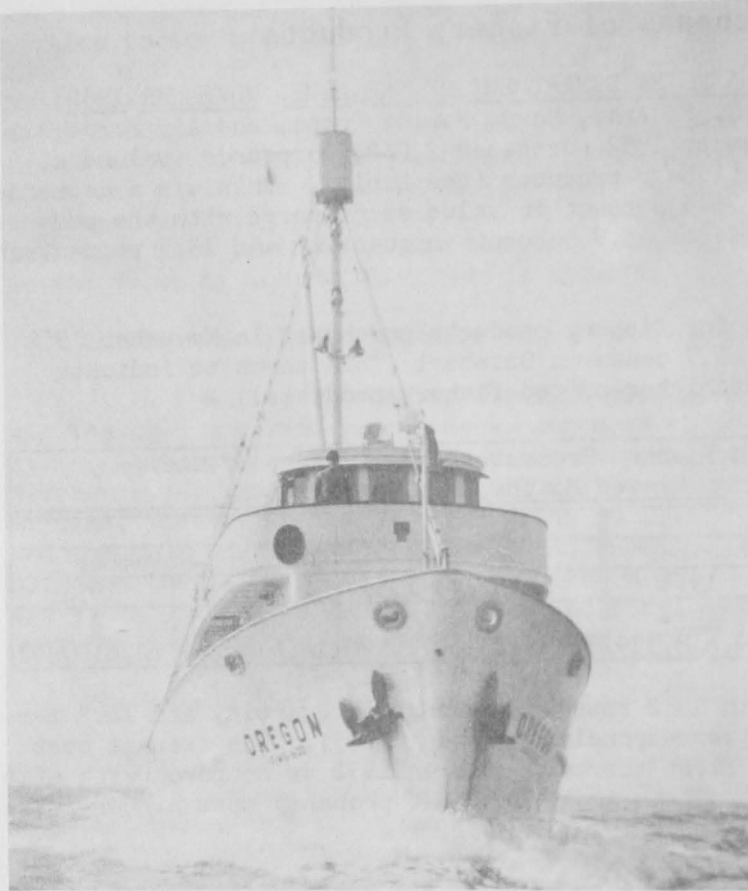
THE SERVICE'S EXPLORATORY FISHING VESSEL OREGON .

" OREGON " REPORTS GOOD SHRIMP CATCHES IN NORTH CAMPECHE AREA (Cruise No. 18): The production of shrimp ( Penaeus duorarum ) in the area north of the present shrimp