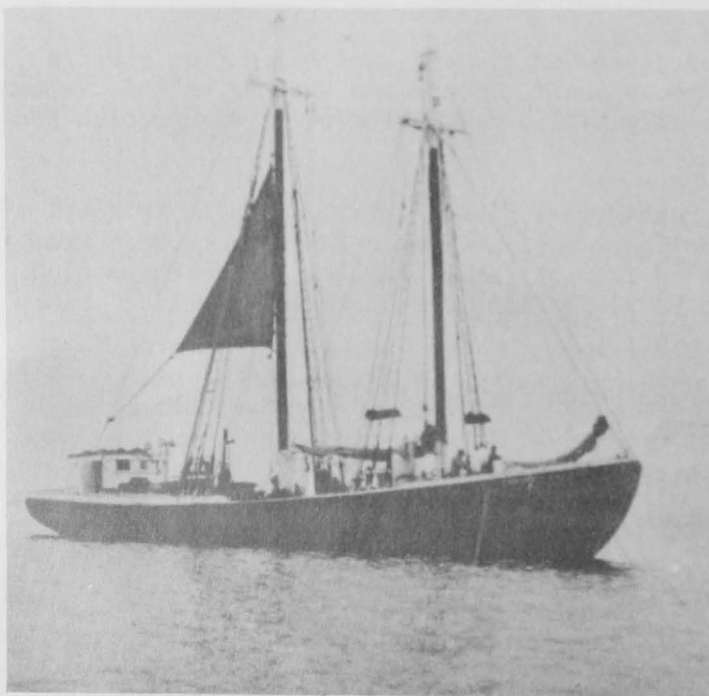
M/V MARJORIE PARKER IS A 78-FOOT SCHOONER CHARTERED BY THE SERVICE FOR CONDUCTING A BLUEFIN TUNA EXPLORATION IN NEW ENGLAND WATERS.

East of Fire Island, New York, 20 baskets of Japanese type gear were set. Additional sets were made off Shinnecock Inlet, Long Island, Block Island, south east of Nantucket Lightship, southwest part of Georges Bank and Stellwagen Bank off Race Point, Cape Cod. No tuna were captured either by long-lining, gill-netting, or trolling operations, and no surface fish were sighted.