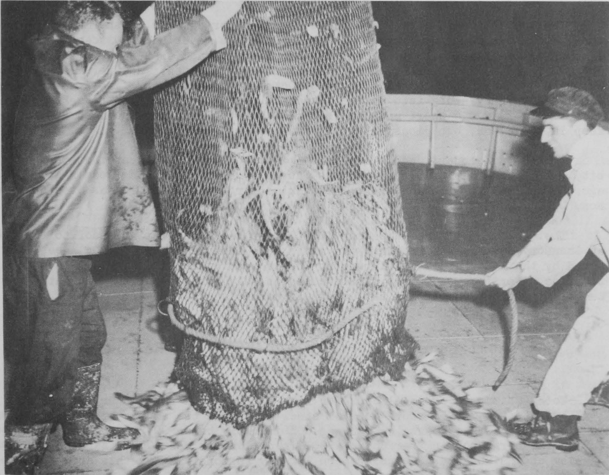
DUMPING A MIXED CATCH OF SHRIMP AND FISH CAUGHT BY THE OREGON IN A NIGHT DRAG. SOME SPECIES OF SHRIMP ARE CAUGHT ONLY AT NIGHT.

Throughout the trip trawling operations were hampered by bad weather. One trawl was lost and 4 others damaged in rough seas. The Oregon tied up in Galveston from November 13 to November 18 waiting for suitable trawling weather.