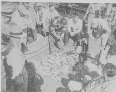
BRINE-FROZEN FISH BEING INSPECTED ABOARD THE RESEARCH TRAWLER DELAWARE BY MEMBERS OF THE ATLANTIC STATES MARINE FISHERIES COMMISSION AND VISITING SCIENTISTS. THE ONE-DAY CRUISE WAS TO DEMONSTRATE THE FISH AND WILDLIFE SERVICE'S EXPERIMENTS ON FREEZING FISH IN THE ROUND AT SEA.

On September 6 members of the Commission and visiting scientists participated in demonstrations staged by the U. S. Fish and Wildlife Service of freezing fish in the round at sea on board the motor trawler Delaware and of Japanese long-line fishing methods for catching tuna on the Marjorie Parker , both of which sailed from the Service's East Boston docks for a full day's cruise.