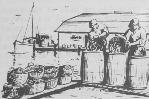
PACKING SHELL OYSTERS IN BARRELS FOR SHIPMENT TO MARKET.

tization of the seed from which the baby oysters grow takes place within the shell of the parent oyster. Shortly before the baby oysters are ejected by the parent to fend for themselves, they begin to develop a shell. If the Old World oyster is eaten at this stage of incubation, the large number of almost microscopic baby oysters, each developing a shell, impart a gritty quality to the meat. Because the reproductive period of