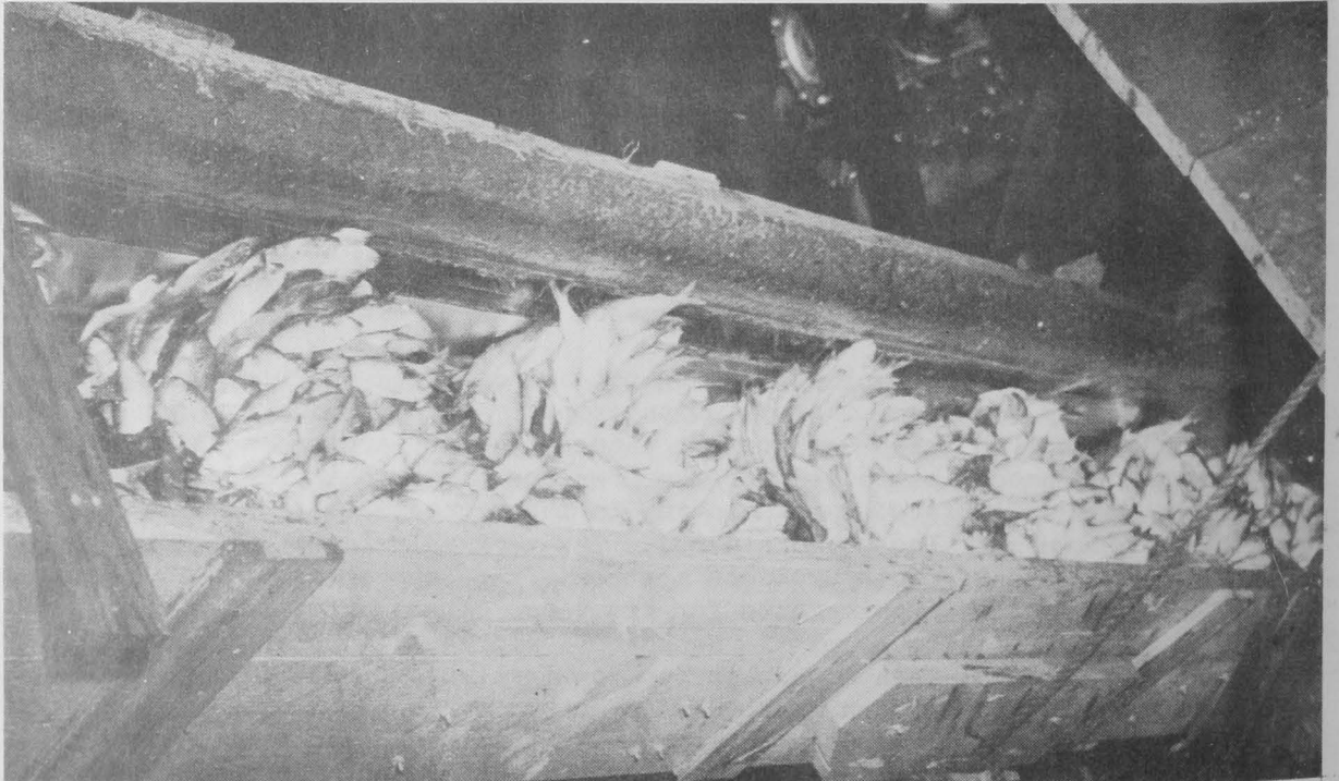
MENHADEN BEING CONVEYED ON BELT SYSTEM FROM THE HOLD OF THE VESSEL TO THE COOKERS.

The discussion in the preceding sections is based for the most part on literature references to uses of products or byproducts of fish other than the menhaden, and the probable explanation of this situation was considered briefly. There is a considerable amount of literature on the menhaden; specifically relating to meal,