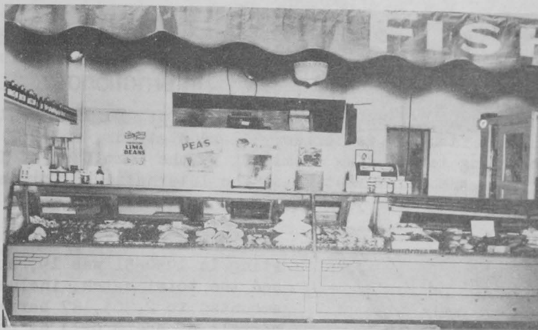
MODERN RETAIL FISH COUNTER.

Fresh, frozen and canned fish and shellfish retail prices during the mid-July-mid-August period were 17.7 percent higher than the corresponding period of 1950, but only .9 percent above the previous 30-day period of this year. Chiefly responsible for the higher retail prices paid for all fish and shellfish is the increase in fresh and frozen fish prices. For the 30-day period ending August 15, average fresh and frozen fish prices at retail were 292.5 percent of the 1938-39 base--1.5 percent higher than the mid-June to mid-July average and 7.2 percent above the August 15, 1950, average.