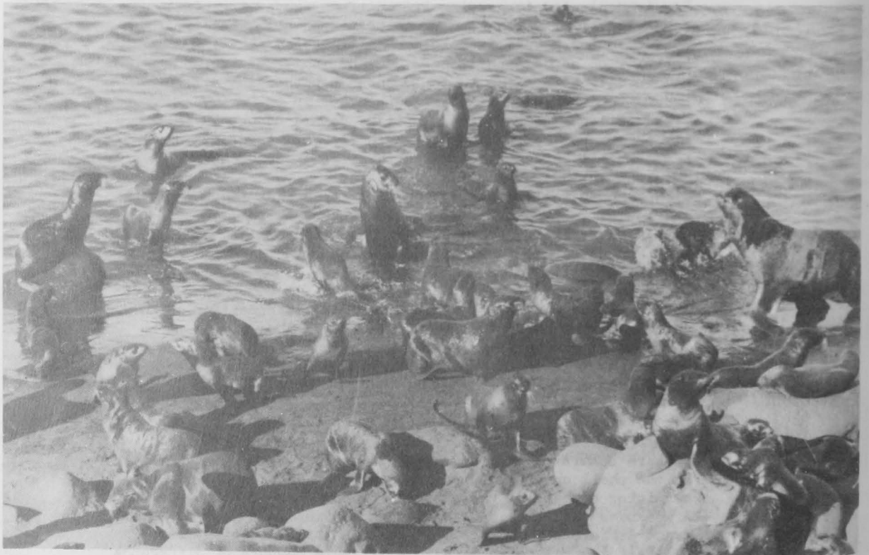
TELEPHOTO SHOT OF BULLS, COWS AND PUPS ON ST. PAUL, PRIBILOF ISLANDS, ALASKA.

The young seals apparently died in the churning seas that accompanied the low temperatures and violent 90-mile-an-hour gales of last January's storms. Like other fur seals, the pups migrate South for the winter, returning to the Pribilofs in the spring. About 3,000,000 fur seals gather in the Pribilofs yearly to breed.