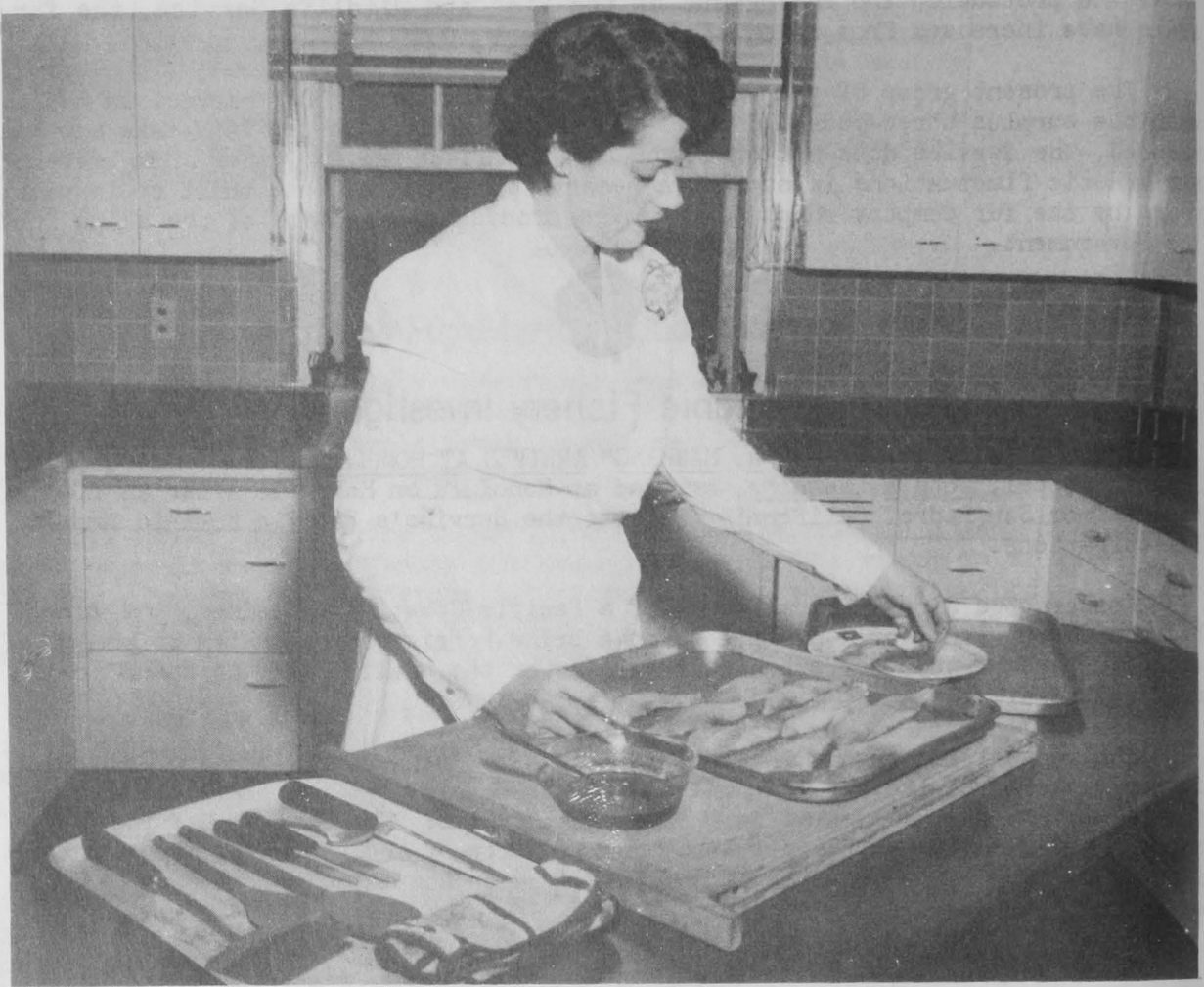
SERVICE'S HOME ECONOMIST PREPARING FISH FOR A SCHOOL-LUNCH DEMONSTRATION.

these it was found that fish was used an average of 2.2 times in November 1947 and 1.9 times in November 1949, or a decrease of 14 percent. The poundage of fish used, however, showed an increase of 2 percent.