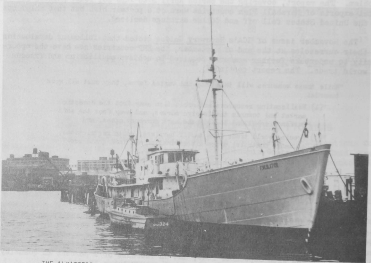
THE ALBATROSS III , AT THE DOCK AT BOSTON, GETTING READY FOR A CRUISE.

Four mesh sizes were compared in these experiments, mainly on rosefish. Large numbers of rosefish were caught by the tows made on this trip.