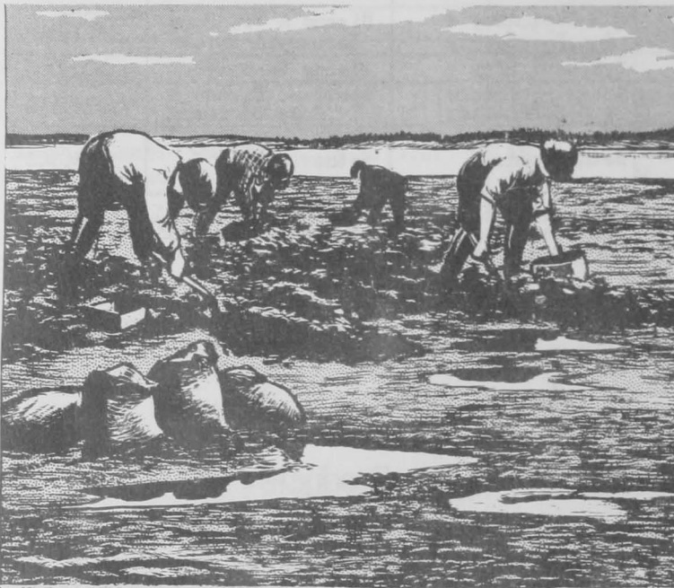
MAINE DIGGERS GATHER SEED CLAMS FOR A RE-SEEDING PROJECT.

PROGRESS ON CLAM RESEARCH PROGRAM: The Clam Investigation authorized by the 80th Congress has developed its plans for the research program on hard- and soft-shell clams. This summer, the headquarters for this Investigation will be moved