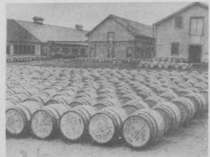
BARRELS USED TO PACK AND SHIP FUR SEAL SKINS, ST. PAUL ISLAND, ALASKA.

Dyed matara brown skins sold for an average $62.87 each, compared to $63.24 at the last auction of Government Alaska fur-seal skins. Average price of safari brown skins was $49.57, as compared with $55.35 last fall. Black skins averaged $62.19, an advance from $49.28 obtained in the previous auction.