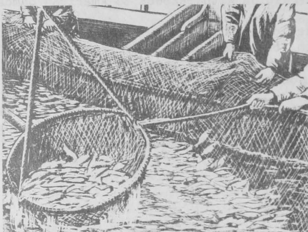
BRAILING MENHADEN FROM THE PURSE SEINE

PRODUCTION: The total menhaden catch in Virginia during the 1948 season, which ended in October, was 40,200,000 pounds (60 million fish) below the 1947 season, according to a November 15 report from the Service's Fishery Marketing Specialist at Weems, Va. In 1948, the total menhaden landings by a fleet of 18