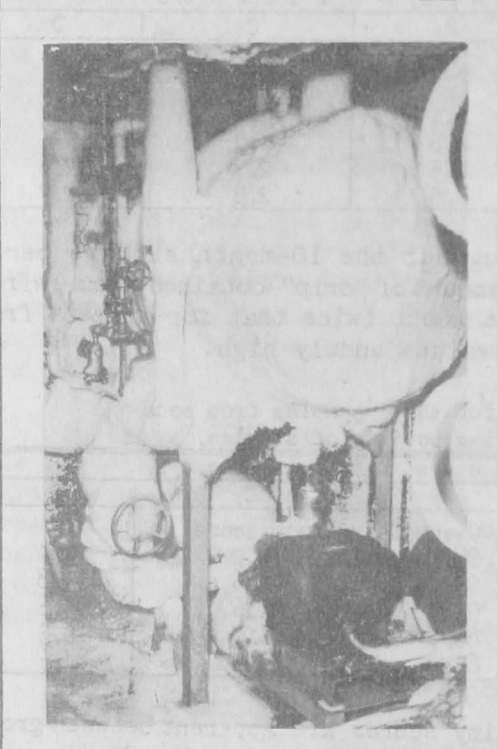
FREEZING EQUIPMENT ABOARD A MODERN TUNA CLIPPER

The tuna fishery employed crushed ice as a refrigerant for many years before the inadequacy of this type of cooling was realized. It was when the tuna clippers extended their trips into subtropical waters that it became evident that it was impossible to carry sufficient crushedice to return with fish in first class condition. During the middle 1920's some of the larger of the tuna clippers installed mechanical chilling, with ice as auxiliary refrigeration. These installations consisted of direct expansion coils directly under the deck and along the sides of the fish hold. The cork insulation was increased on the walls of the hold.