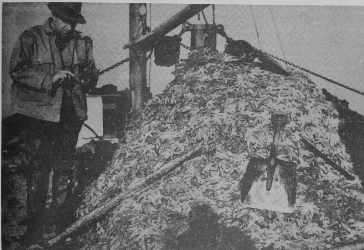
STARFISH CAUGHT IN FOUR HOURS BY A CRAB DREDGE BOAT (CRABBING) IN CHESAPEAKE BAY

technical grade acid, 56 Baume acid, cost at that time about 3 cents a pound in 5-gallon carboy lots. Great care is needed in the mixing operation. The concentrated acid is rapidly, and the dilute acid more slowly, corrosive to both skin and clothing, and the dilute acid rapidly attacks any metallic equipment unless lead lined. Rubber gloves and rubber equipment are desirable as protective clothing, and a stoneware crock is the best mixing container usually available. In the use of stoneware, care is also necessary to prevent cracking from the heat generated by too rapid addition of acid to water. The above properties should be considered because of the danger which would be involved if the acid were to be handled by oystermen or farmers without special equipment and knowledge of the precautions necessary for safety.