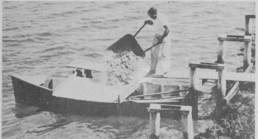
PLANTING FOSSIL SHELL MATERIAL--"BELGRADE ROCK"--FOR COLLECTING SEED OYSTERS AT THE NORTH RIVER EXPERIMENTAL OYSTER FARM AND BEAUFORT, N. C. SERVICE LABORATORY

A series of tests were made to determine the suitability of a type of fossil rock to be planted on oyster beds for the collection of oyster spat. After a two-week setting of oyster larvae, the fossil rock was covered with as many spat as the clean oyster shells which were planted at the same time.