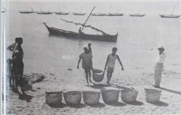
Small fish and prawns are carried in mat baskets onto beach 11 miles from Karachi, where they are sold.

Two new fishery-development projects were approved recently by the Executive Committee of Pakistan's National Economic Council. The projects are: sea exploratory