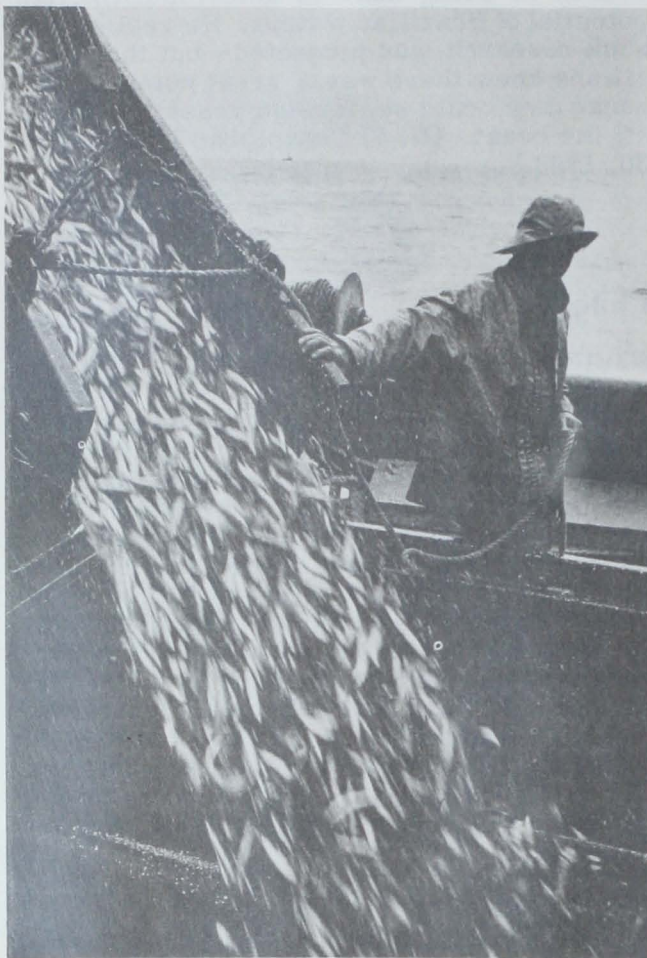
A rich catch of anchovies flows into hold of Iquique-based boat. The fish are abundant off Northern Chile and are converted into meal and oil for export.