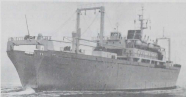
The Soviet stern freezer trawler "Pelengator" was launched in March 1968. Built in a Copenhagen shipyard, she is the first Soviet vessel to be used in high-seas training of fishermen. Four similar vessels will be built. The Pelengator was assigned to the Murmansk Fisheries Administration.

The first fisheries training vessel was delivered to the Soviets by Burmeister and Wain (B & W) of Copenhagen, Denmark, in early March 1968. The vessel is 103 meters (337.8 feet) long and can accommodate 182 persons, including about 110 fishermen-trainees. A classroom for 25 pupils is located forward on the third deck.