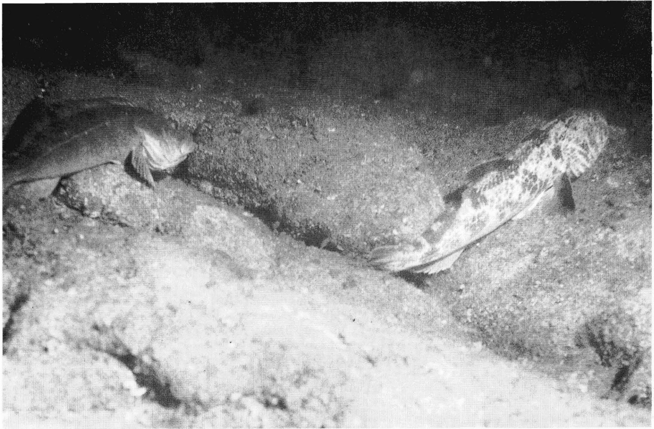
Figure 2.—Lingcod exhibiting both types of coloration observed during lingcod nesting study, April 1992, southeast Alaska.

lingcod did chase other lingcod, yelloweye rockfish, and greenlings, Hexagrammos spp., swimming near nests. Local fishermen have reported both female lingcod and yelloweye rockfish full of ingested lingcod eggs. Conversely, schooling fishes, such as black rockfish, S. melanops , were observed near lingcod nests but the nesting lingcod seemed undisturbed by their presence.