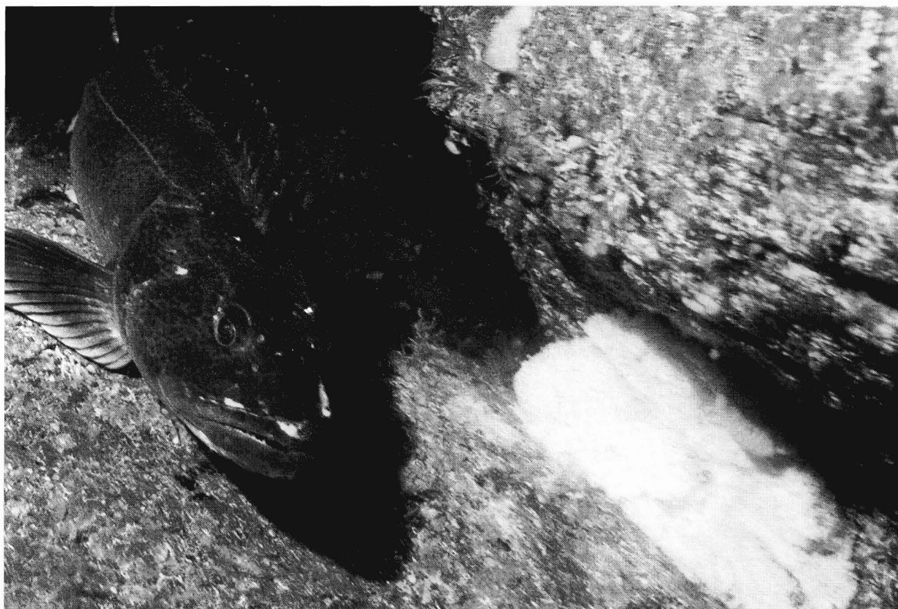
Figure 3.—Nest-guarding lingcod exhibiting dark coloration and head scarring, April 1992, southeast Alaska.

sible that the determining factor for distribution of nests is the presence of suitable habitat in areas of high current (Low and Beamish, 1978; Giorgi 1 ). In highly productive areas, such as offshore pinnacles, the availability of suitable nesting sites near excellent feeding grounds may make it unnecessary for females to migrate elsewhere.