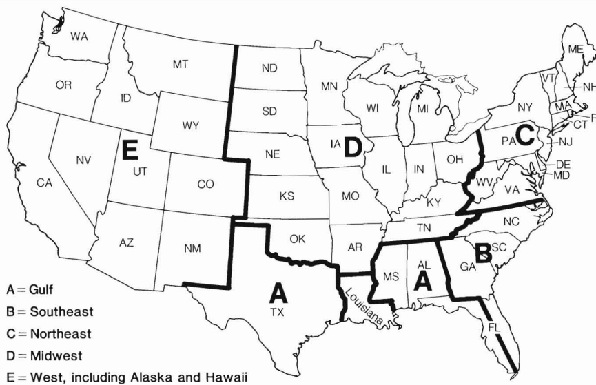
Figure 1.—Market areas for Louisiana shrimp.

dried. Fresh and frozen headless shrimp were combined into one product type, headless shrimp, because of their similarities and the relatively small amount of fresh headless shrimp produced (5.5 percent of total production). Peeled, breaded, and dried shrimp were combined into the category of "other" shrimp, since the latter two products represented only 2 percent of total volume sold by the surveyed firms and were sold by one and two of the firms, respectively.