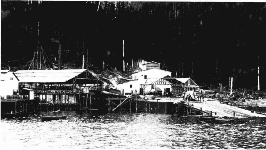
The whaling station which operated at Kyuquot, Vancouver Island, from 1919 until World War II.

of modeling exercises at the special workshop on right whales, concluded that to achieve population growth rates greater than 5 percent, survivorship would have to be much higher than thought by the scientists present. This exercise pointed out that while there are many inconsistencies in the available data, as well as in using certain assumed but contested parameters (e.g., survivorship and annual calf proportion), recruitment rates in right whales are probably lower than suggested by the apparent growth of the South African and Argentine populations, and that indeed net recruitment is likely among the lowest of the large baleen whales. Empirically, this seems to be supported by the apparent low rate of recovery of all right whales (including bowheads) in this century.