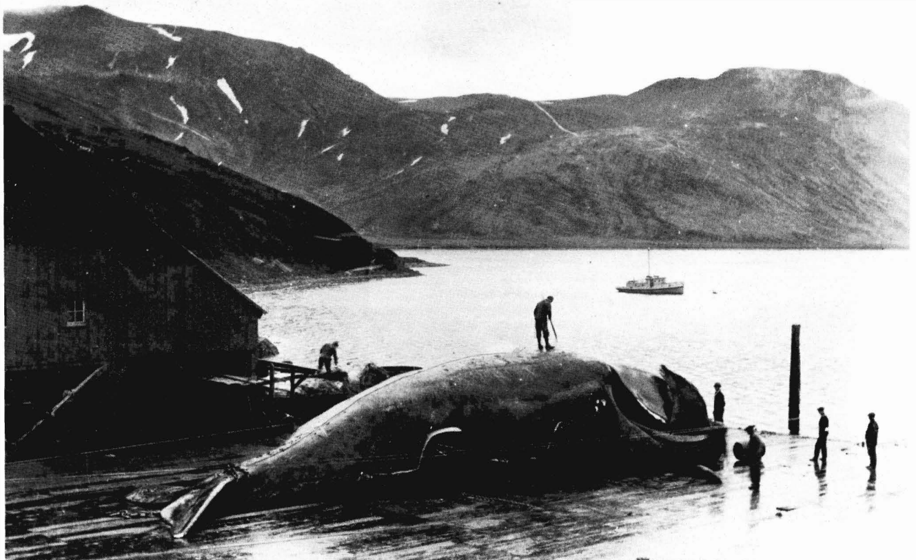
A large right whale (lying on its back) on the flensing platform of the former whaling station at Akutan in the Aleutian Islands. Some of the 8-foot long baleen plates are protruding from the left side of the mouth.

menced in the late 1800's, right whales were so rare worldwide that they were almost never encountered. The modern fishery concentrated on blue, Balaenoptera musculus ; fin, B. physalus ; and humpback, Megaptera novaeangliae , whales which the old-style hand-harpoon fishery had largely ignored.