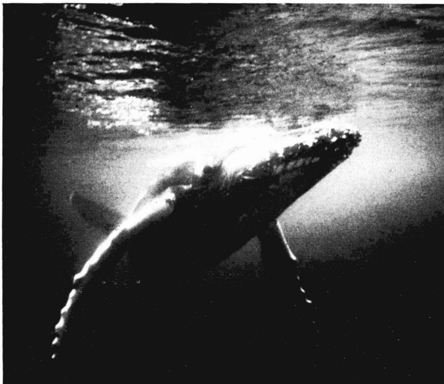
A humpback whale on its wintering grounds near Maui, Hawaii. Note the extremely long flippers.