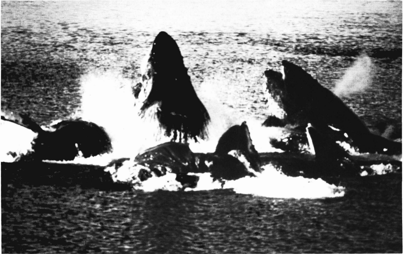
A group of eight humpback whales engage in coordinated feeding behavior in Frederick Sound, southeastern Alaska.