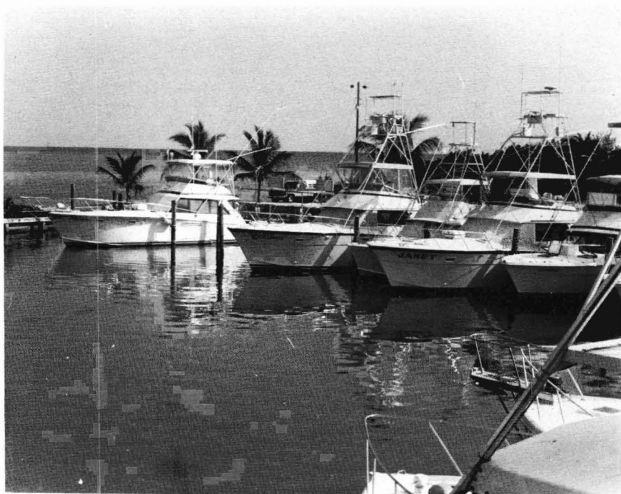
Offshore charter boats at Whale Harbor, Islamorada, Fla.

Target species of the inshore-offshore fishery overlapped those of the other three fisheries and included bluewater, reef, and shallow-flats species (Table 7).