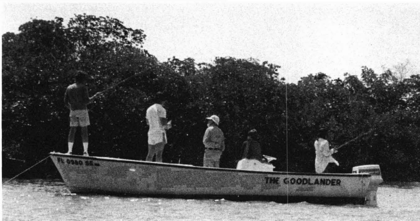
Back-country fishing among mangrove islands near Goodland, Fla.