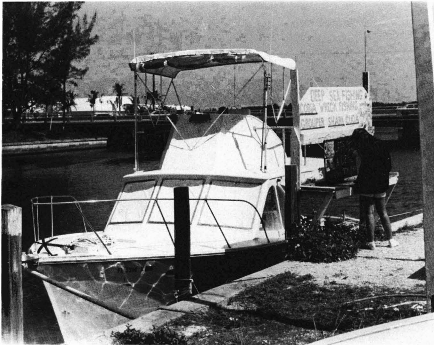
Typical vessel in the inshore-offshore charter fleet.

West Florida The primary target species of guide-boat operators on the west coast of Florida were snook; tarpon; redfish; spotted seatrout, Cynoscion nebulosus ; and gray snapper, Lutjanus griseus (Table 8). Snook was the most important species. In spring, summer, and fall, 35 percent, 47.3 percent, and 29.1 percent of fishing effort was directed at snook. Redfish was the second most important species, being first in the fall and second in winter. Seatrout was a close third, being first in importance in winter and third in summer and fall. The many species in the category "other" include Spanish mackerel; grouper; flounder; pompano, Trachinotus carolinus ; cobia; and bluefish, Pomatomus saltatrix . None of these composed more than 2 percent of mean fishing effort in any season.