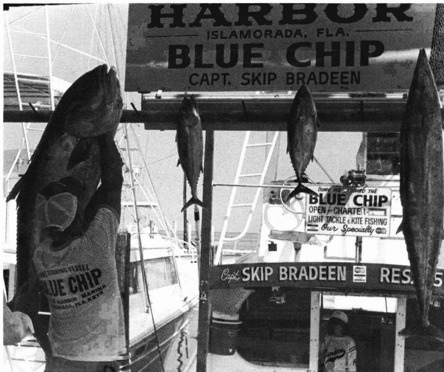
Offshore charter-boat action at Whale Harbor, Islamorada, Fla.

Regional differences were found in the distribution of boats between major public or commercial docks, small commercial docks, and private docking facilities. Boats were concentrated at a few major facilities in northwest Florida. Along the west coast, boats were located at a number of relatively small commercial docks, but the sizeable portion of listed names that could not be found at the commercial docks suggests that small private docks may also have