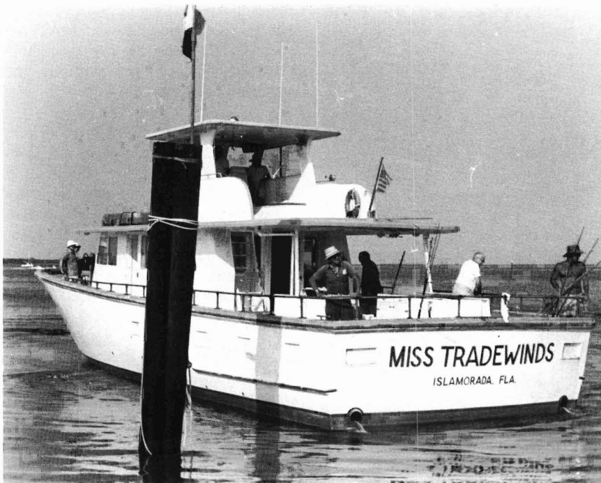
Head boat returning to Whale Harbor.

recreational catches and a serious threat to the king mackerel stock by 15 percent of responding captains in northwest Florida, 20 percent in west Florida, and 12 percent in the Keys. Declining catches of grouper were mentioned as a problem by 16 percent of respondents from west Florida. Red tide outbreaks, which can greatly reduce the abundance of fish on the nearshore reefs, were indicated as a problem of major concern by 24 percent of responding captains on the west coast.