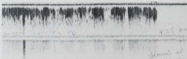
Figure 1.—Recording of squid from the Mari-Gale-Barbara , 13 August 1974, 6 miles south of yellow hills on Martha's Vineyard in 14 fathoms with four 1,000-watt lights on.

The trawl is illustrated in Figure 2 and is referred to as a two-bridle Bleakspruttetrawl. It is a modified version of three-bridle Bleakspruttetrawl which is a symmetrical two-piece trawl with wedge pieces in the sides and utilizes 32-inch stretched mesh size in the face. The trawl is rigged with a 2-inch rubber disc sweep and towed in a similar manner as a mid-water pair-trawl with no floats on the