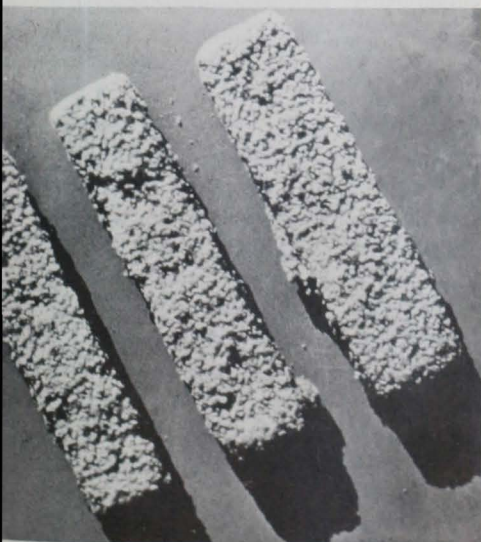
Fish sticks made with solubilized fish binder and commercial breading.

This estimate is also based on the assumption that ionic strengths can be calculated from molar concentrations of the salts involved. For completely ionized salts such as NaCl, this assumption is valid. However, a concentrated solution of TPP alone (12.5