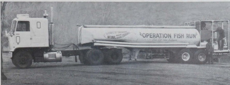
Figure 1. — Truck and trailer used by NMFS to haul juvenile salmon and trout down the Snake and Columbia Rivers in 1972.

Each tank was divided into two main compartments, the forward compartment having three splash baffles and the rear compartment having a single baffle. The combined capacity of the compartments was 5,000 gallons. However, part of the interior was needed for the overhead sprinkler system which reduced the hauling space to about 4,000 gallons, with 2,200 gallons in the front compartment and 1,800 in the rear compartment. A refrigeration unit, recirculating pump, and filter, in addition to liquid and compressed oxygen bottles, were installed on a platform at the rear of the trailer. The complete