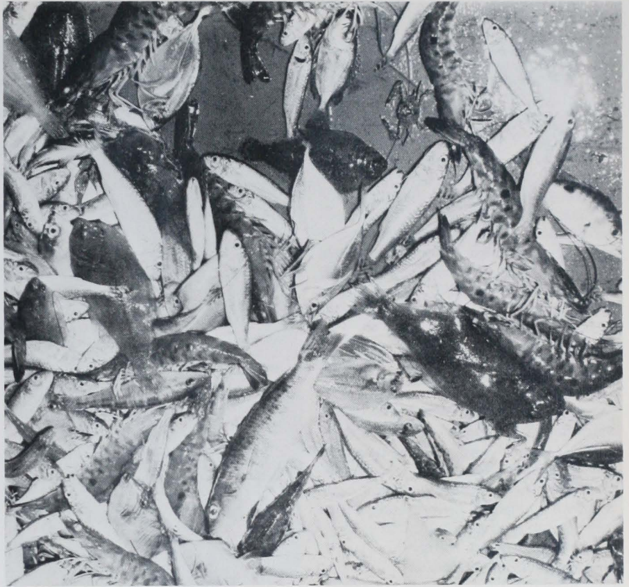
Figure 2.—Catch of shrimp ( Penaeus brasiliensis ) and fish on deck of RV Oregon II. This photograph is typical of the catches made during cruise 38.

A total of 637 pounds (heads-on) of shrimp were caught at the 67 fishing stations. This catch included 340 pounds of brown shrimp ( Penaeus aztecus subtilis ), 268 pounds of pink spotted shrimp ( Penaeus brasiliensis ), 25 pounds of pink shrimp ( Penaeus duorarum notialis ), and 4 pounds of white shrimp ( Penaeus