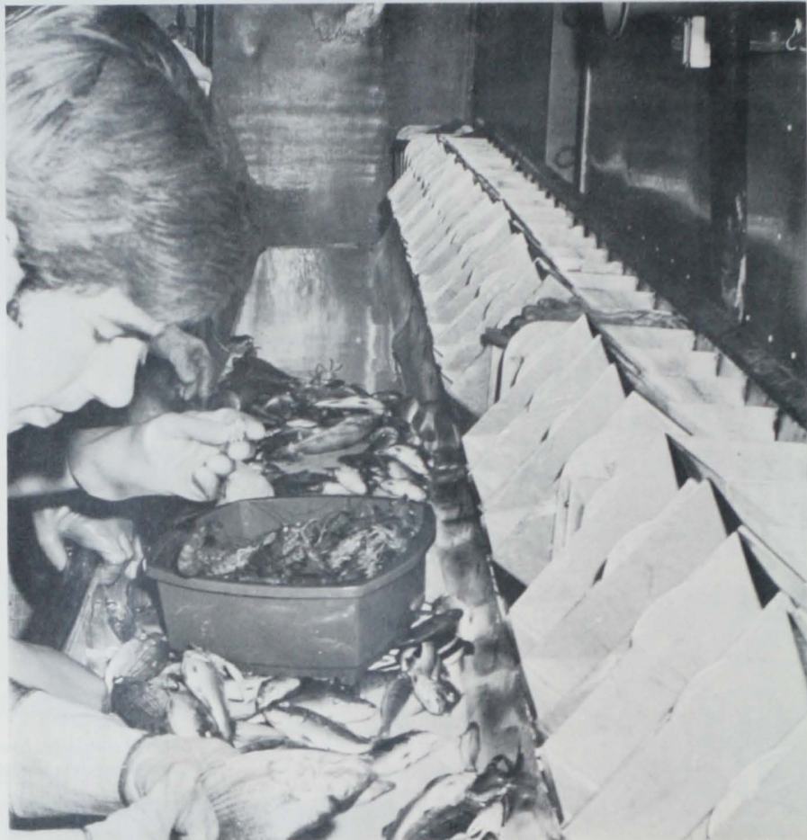
Figure 4.—Sorting of the trawl catch into species categories. The numbers and weights of each species were recorded.