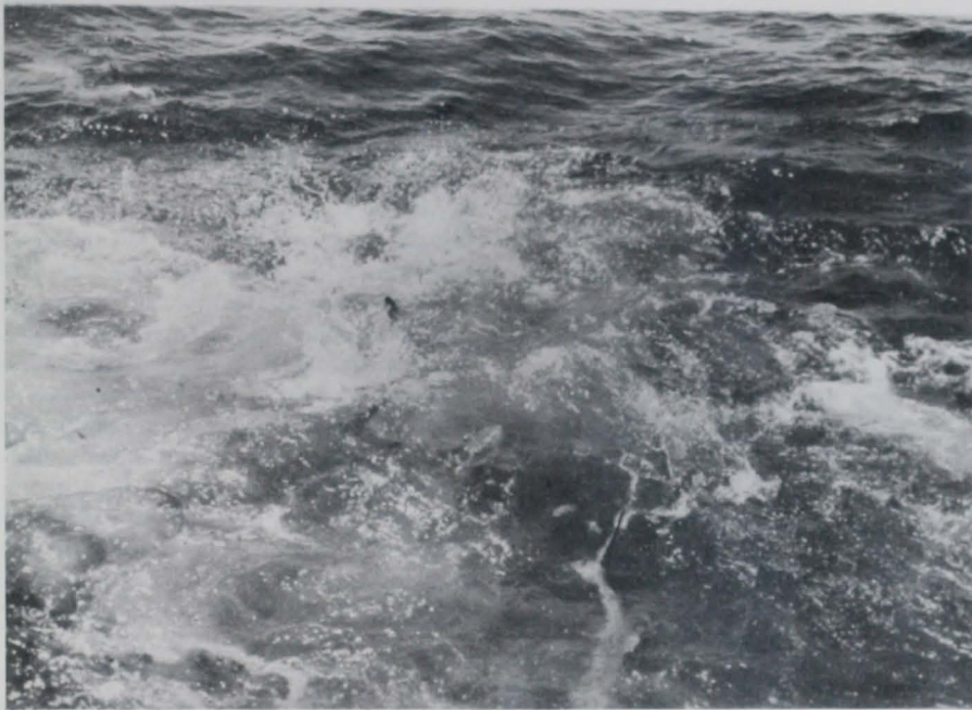
Figure 6.—Feeding frenzy behavior of large sharks near Devil's Island, French Guiana. The sharks were chummed to the boat with trash fish.

Maximum catch rates by species of shrimp were as follows: pink spotted shrimp, 30 pounds (heads-on) per hour; brown shrimp, 120 pounds; pink shrimp, 36 pounds; and white shrimp, 4 pounds. The average sizes of shrimp in the above maximum catches were: pink spotted shrimp, 9.8 per pound (heads-on); brown shrimp, 17.6; pink shrimp, 8.6; and white shrimp, 8.3.