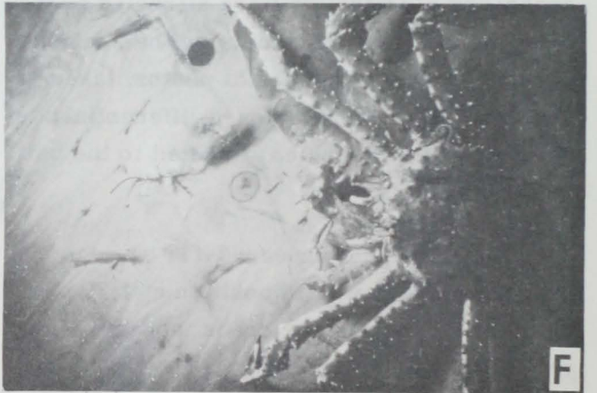
Fig. 2 - Selected photographs from series taken over an 18-hour period with a camera-strobe system.