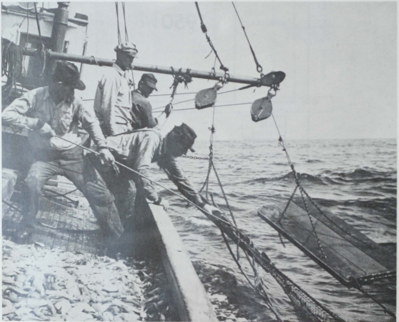
Shrimp trawling in Gulf of Mexico off New Orleans. Trawl and otter boards, suspended from outrigger boom, are being lowered back to fish again. Part of last mixed catch of fish and shrimp is on deck. (C.H.B.)

In summary, commercial fish catches in the Gulf and South Atlantic region have increased tenfold in the last forty years, and more than doubled in the last twenty. Prospects for even further increases are likely--to a level approaching three billion pounds a year.