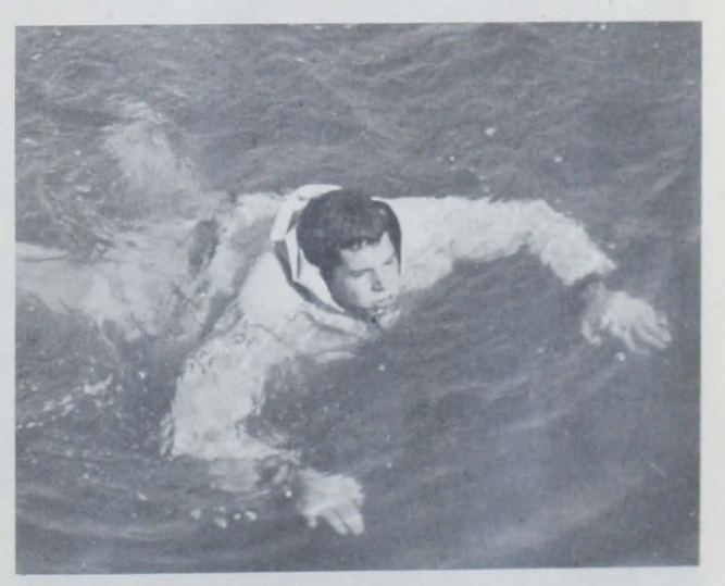
Fig. 2 - Temporary buoyancy results from air trapped in clothing and rain gear.