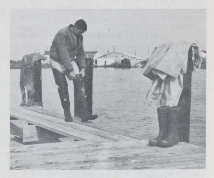
Fig. 1 - Equipment used in simulated accidents.

When you fall feet first into the water, air is forced out of your boots but is often trapped in your clothing, thus creating temporary buoyancy (fig. 2). Thrashing around in the water will not only tire you but will also cause you to lose this buoyancy. If you are wearing trousers and a T-shirt when you enter the water instead of bulky clothing, no air will be trapped in your clothing and you could sink several feet; however, it is a simple matter to return to the surface by raising your arms overhead, cupping your hands, and then pulling them to your sides at moderate speed. Using your legs in this situation is a waste of energy