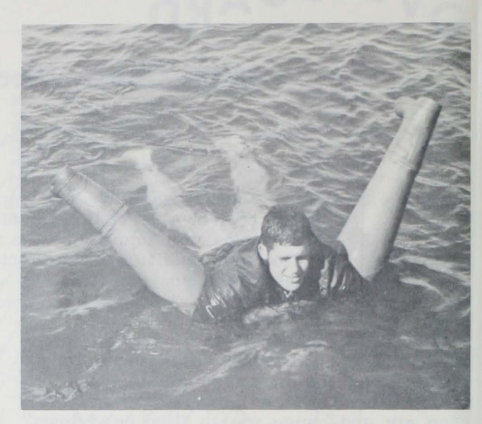
Fig. 4 - Chest waders can save your life when used as "wader wings."