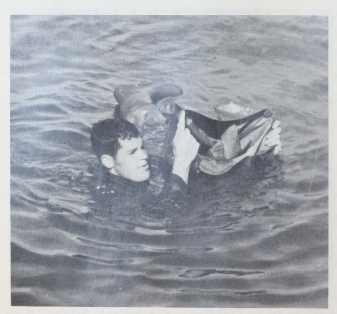
Fig. 3 - Preparing to swing chest waders overhead to force air inside.

If you are wearing waders, they can be quickly converted into a life preserver. After you allow them to fill with water, remove them and bring them to the surface upside down to drain most of the water. Hold the top of the waders on each side and work them behind you; then swing them rapidly overhead with the top held open and continue down into the water in front of you (fig. 3). At this point there should be more than enough air in the legs of the waders to keep you afloat. If not, repeat this procedure. Then, holding the top underwater, you can slide between the legs of your emergency "wader wings" (fig. 4).