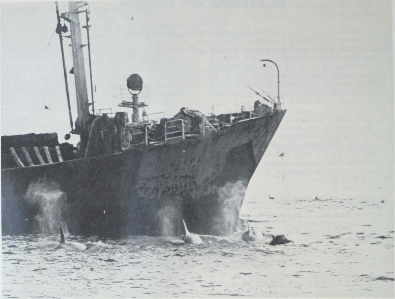
Fig. 1 - HOT PURSUIT: 4 killer whales round ship's bow in close pursuit of sea lions.

KILLER WHALES PURSUE SEA LIONS IN BEHIND SEA LIONS