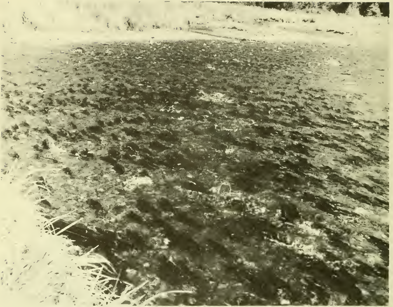
Figure 4.—Pink salmon spawning in the intertidal zone of a creek.

In addition to the commercial uses for pink salmon, Indians and Eskimos along the Arctic coasts take thousands of them in traps and gill nets for personal use.