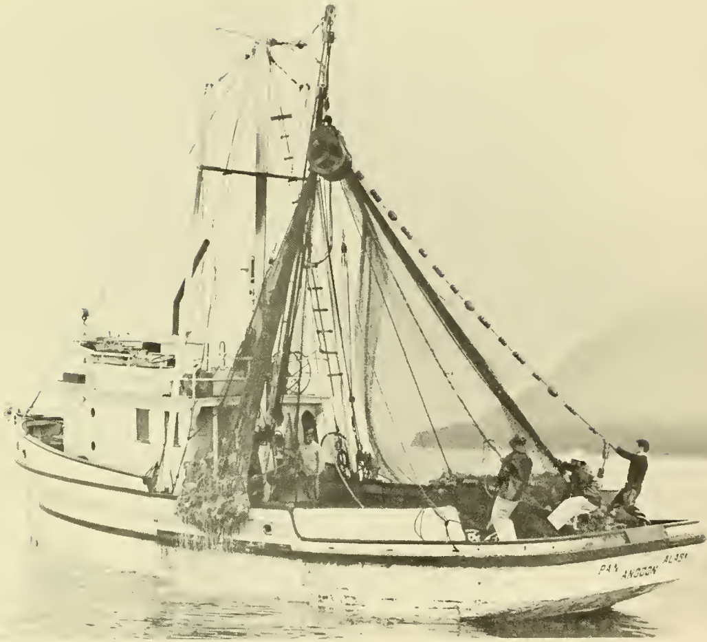
Figure 5.—Hauling in the net on a pink salmon purse seiner. When set for fishing, the net encloses an area of about 2 acres.