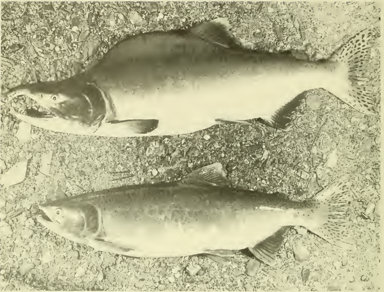
Figure 1. - Mature pink salmon—male (upper), female (lower).

in southern British Columbia and Puget Sound, runs large enough for profitable commercial fishing occur only in odd years. Conversely, in western Alaska since 1954, the even-year runs have been the larger. Fortunately the major pink salmon-producing areas of Alaska do not suffer from this type of off-year scarcity.