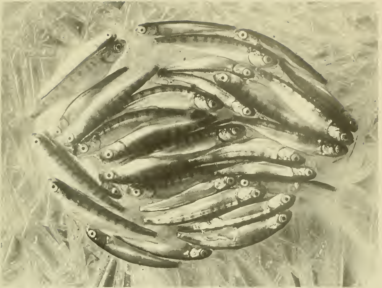
Figure 2.—Pink and chum salmon fry that have just emerged from the streambed. The pink salmon are distinguished by their smaller size and the lack of the parr marks that are noticeable on the backs of the chum salmon fry. In these live fish the fins are nearly transparent because they are very thin and unpigmented.

and a new egg pocket is formed to receive the next cluster. Sand and gravel protect the eggs from sunlight, floods and predators, and the female protects them from being dug up by other females who are digging their own redds.