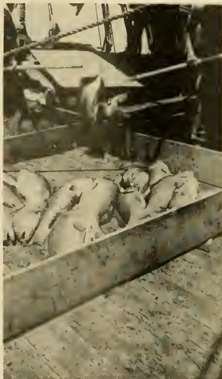
Fish ready for packing in ice.

Frozen fillets are not prepared or sold in Cuba.