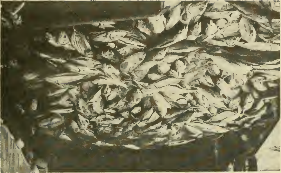
Bonito or tunny fish, ready for cannery.