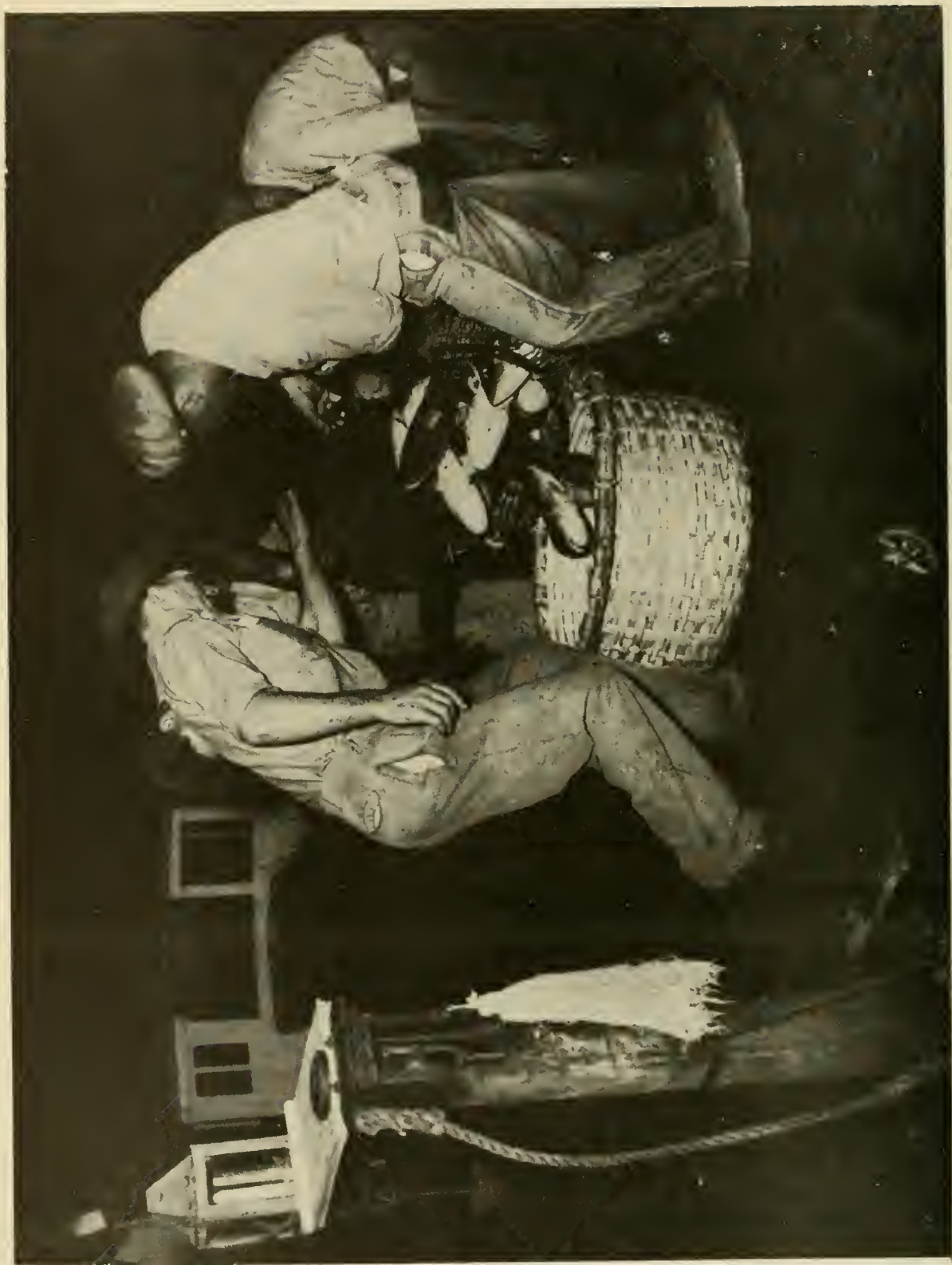
Unloading fish from perforated floats (cachuchas).