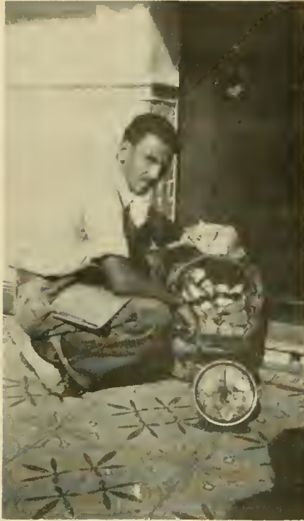
Fish-monger in Habana sells from house to house.