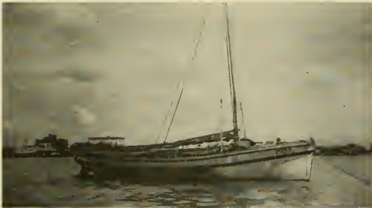
Some heavy-duty row-boats with removable mast also are used for coastal fishing.