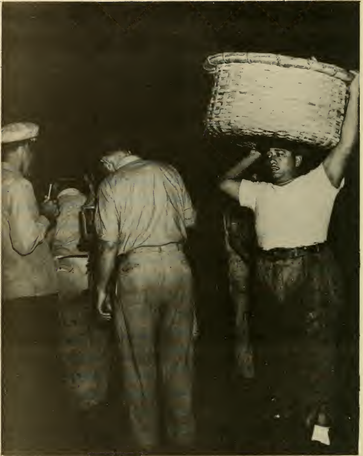
Weighing red grouper before delivery to retail markets.