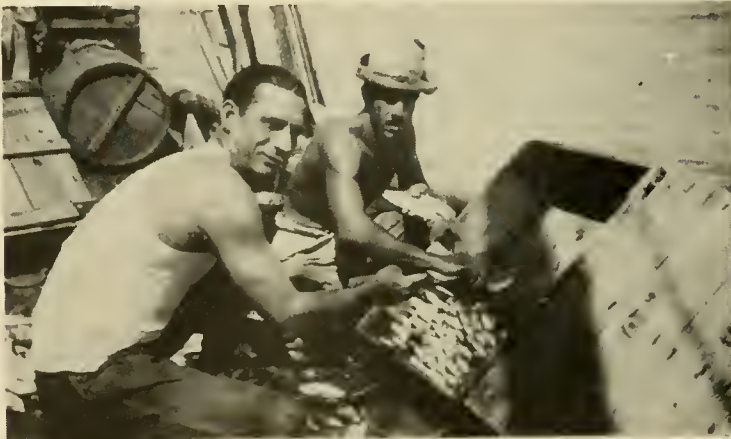
Small fish are packed in wooden boxes at Batabano.