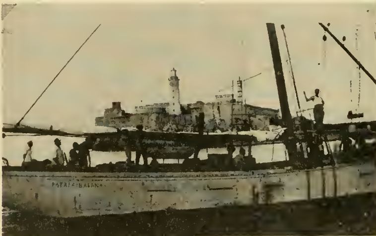
Deep-water fishing vessel.

d. Adequacy of fleet. The Cuban fishing fleet and its gear reportedly are fairly adequate to meet present demand of the industry, although there is still some difficulty in securing fishing equipment. The Cuban Government hopes to increase production by increasing and modernizing the country's fishing fleet.