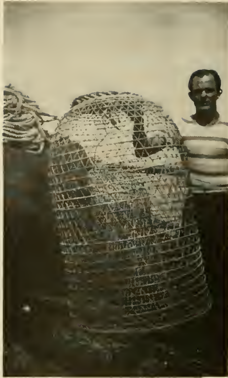
Nassau grouper off Cuba's coast are caught with trap nets such as this (nasa).