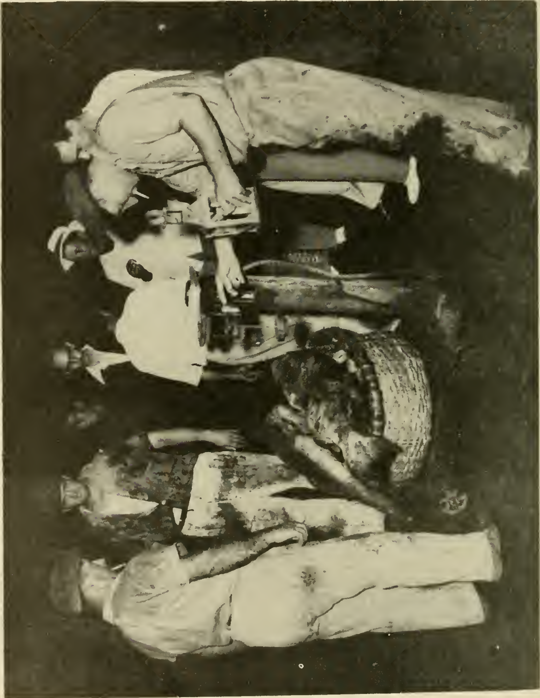
Baskets with 250 pounds of fish are carried to trucks for delivery to market ("El Mundo")

The floats have a capacity of 5,000 or 6,000 pounds each, and are towed into Habana every night. The cargo is transferred into large baskets weighing about 250 pounds each and carried on porters' heads to the place where the fish are weighed. They are then loaded onto trucks which complete delivery to markets at around 2 A.M. Ice-packed fish reach Habana by sea, rail and highway.