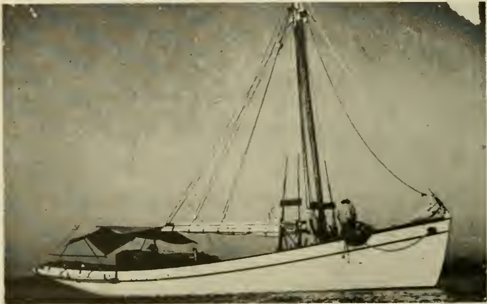
One-mast sailboats are the type mostly used for coastal fishing.