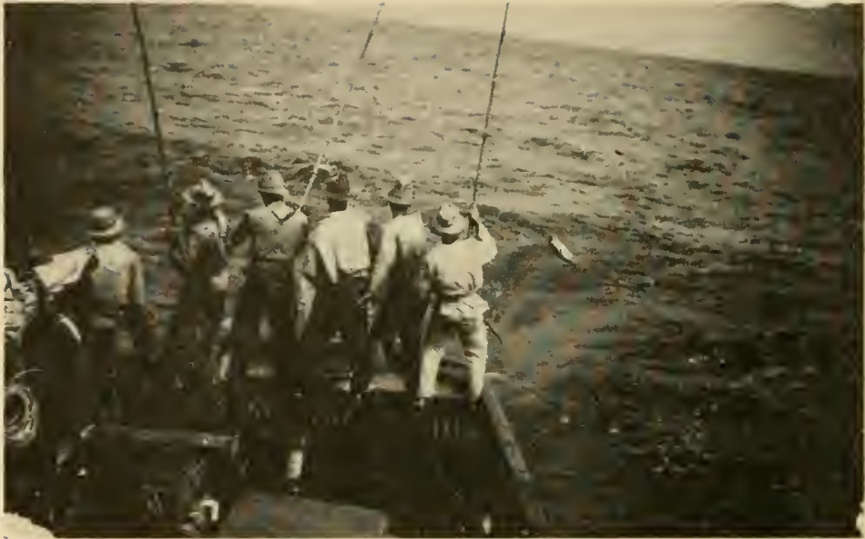
Fishing tunny for canning is a slow process.