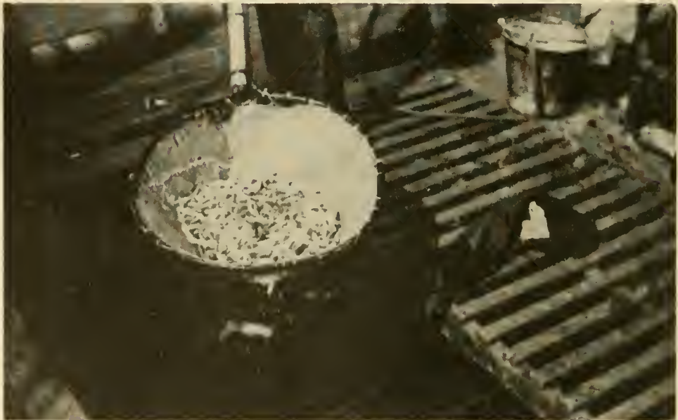
Bait for tunny consists mostly of minnows (manjua sardine).