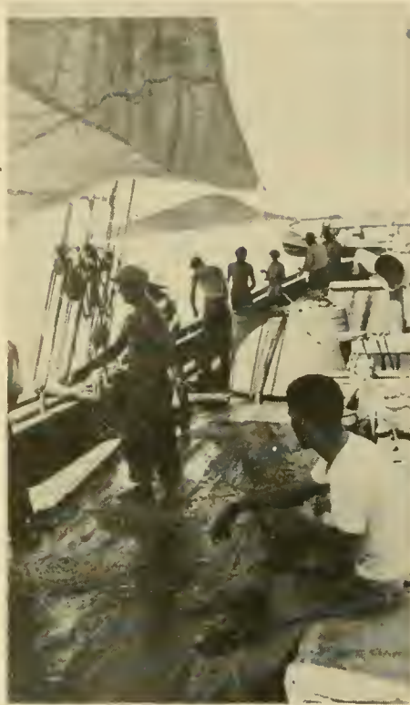
Using individual line and hooks.

Offshore. Fish are taken as deep as 35 fathoms, but 20 is the average. Fish taken from greater depths do not survive the trip back to consumption centers. Individual handlines with three hooks are used for fishing deep-water grouper, red snapper and kingfish off the Mexican coast. Fish caught by this method comprised about two-fifths of Cuba's total consumption prior to the war, and roughly one-fourth since then. Fish for canneries (tunny-fish, albacore and bonito) are caught by the Japanese method of individual line and hook similar to that employed on the Pacific coast of the United States.