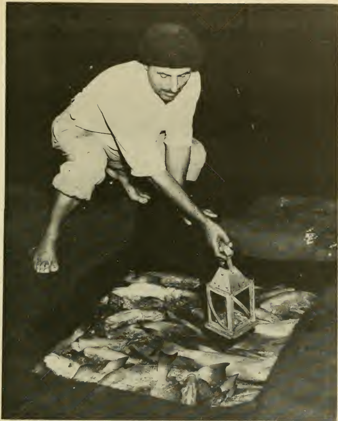
Fish from the Gulf of Mexico ready for delivery to Habana markets.