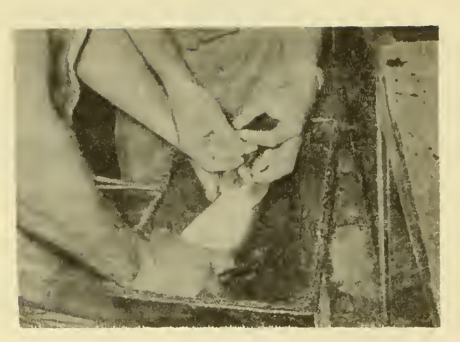
Figure 4. --Fem ale is held in a plastic screen net while pituitary injections with penicillin-G is being administered by glass hypodermic syringe and a No. 20 needle into the body cavity near the base of the pelvic fin.

The death of 4 fish from various injuries (male bites, handling) and 5 instances of altered frequencies due to experimental errors limit evaluation of the data, but these conclusions may be drawn: (1) Fish in every dosage category spawned; therefore, the frequency and size of the dosage were probably not critical within the limits of this experiment. (2) The total amount of pituitary materials used to induce spawning in a fish varied from 3 milligrams to 32 milligrams per pound of body weight. (3) With the exception of 1 fish, which spawned with 1 injection of 4 milligrams per pound of body weight, the fish that received the greatest number of injections (5) at the lowest dosage (1 mg/lb) spawned with the least amount of pituitary material. These data suggest that the gona-