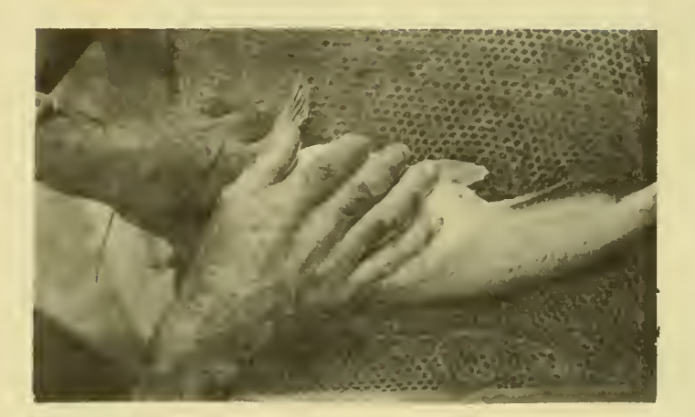
Figure 1. --One of the more reliable characteristics of an imminent spawner is the raised portion of the body wall behind the pelvics.

offspring, and predation by adults can be minimized or eliminated.