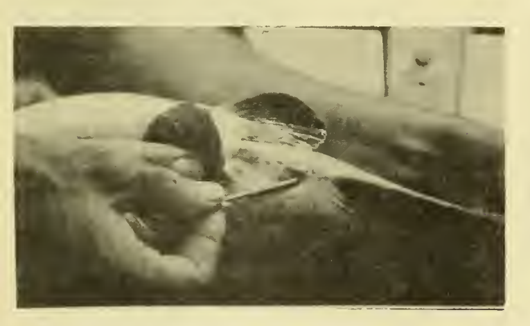
Figure 3. --Male channel catfish can be distinguished from the female by the tubular nature of the external genitalia.

The fish from which the pituitaries were obtained were not classified as to sex and state of sexual maturity, but the month of collection was recorded. Only those fish believed to be large enough to be sexually mature were used as donors. The minimum size of the fish approached the adult size as determined by age and growth studies of fish in Oklahoma. Small fish do