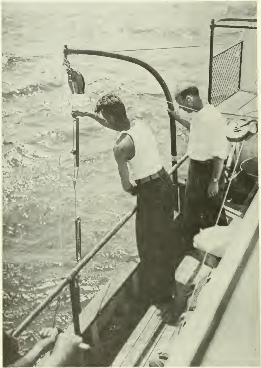
Figure 2. --Shows method employed 1930-32 in taking water temperatures. The cable was attached to the drum of a hand-operated winch, the position of which is indicated by the grasped handle in the lower left corner.