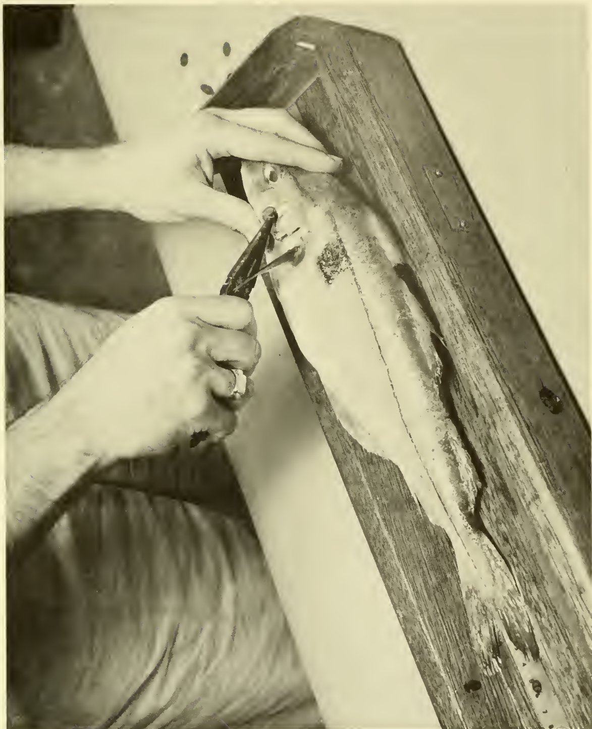
Attaching a Petersen disc tag to the operculum of a haddock.