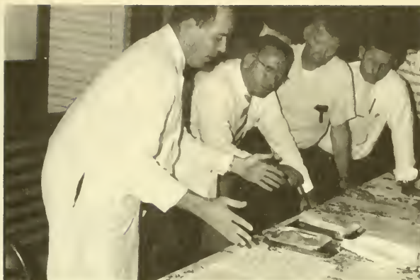
Figure 4.--Presentation of proposed standard to industry members.

grade standard for frozen fried fish sticks, will show if there is a need for tightening of these standards.