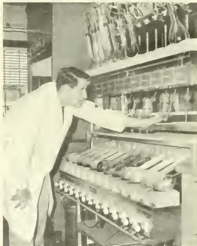
Figure 10.--The determination of the protein content of fish muscle using the Kjeldahl apparatus.

Information on the composition of fish enables the processor to calculate his yield and costs, and the nutritionist and dietitian to make recommendations regarding the components of normal and special diets. During the past year, studies have been conducted on the physical composition (size, weight, and