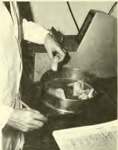
Figure 3.--Chemist weighing fillets for evaluation of uniformity of fillet size.

A grading survey of frozen fish sticks was initiated as part of the program of developing and maintaining standards to reflect current production practices. This survey, conducted 3 years after the adoption of a U. S.