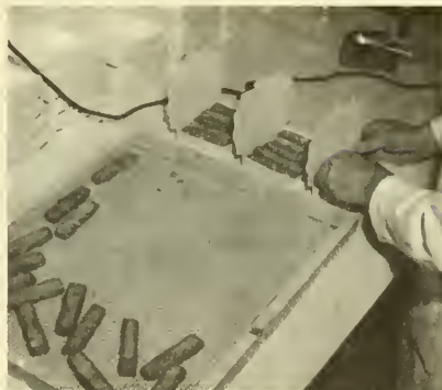
Figure 5.--Packaging fish sticks for frozen-storage tests.

The preservation research at this laboratory is designed to answer questions such as: How long can fish fillets be kept in frozen storage? What will be