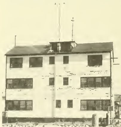
Figure 1.--The East Boston Laboratory

dustry products, classifies and develops quality characteristics and testing methods, and holds meetings with members of industry to discuss and evaluate proposed quality requirements. Then standards are developed which serve as a quality gauge to facilitate wholesale buying and selling. In a similar fashion, Federal specifications are developed for industry and military and civil agencies. They are used to standardize Government purchases, thereby allowing industry to compete for contracts on an even and fair basis and assuring the buyers of good quality fish at regular market prices.