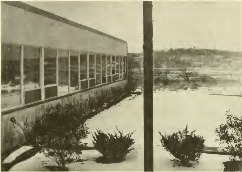
Figure 2.--The new Gloucester Laboratory