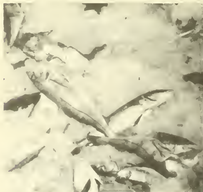
Figure 14.--Haddock in ice aboard the vessel.

The objective of this project was to improve the quality of the fish being landed in Massachusetts ports. This work was carried out under contract by the Massachusetts Division of Marine Fisheries and consisted of having an experienced commercial fisherman, referred to as a principal investigator, make trips on commercial fishing vessels in order to provide instructions in the icing and handling of the fish and in the maintenance of proper sanitary conditions.