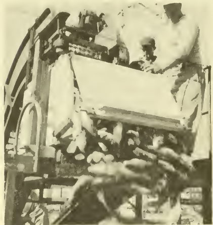
Figure 8.--Dumping the weigh box of the de-icing and weighing machine.

mixed in with the fish falls through openings in the hopper or the conveyor belt; the remainder is removed by hand. The conveyor carries the fish up to a box, mounted on a scale, where the fish are weighed and emptied into tote boxes for transport to the processing line. This machine eliminates at least one pitchfork operation and the need for a price allowance for ice that is normally unloaded with the fish.