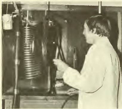
Figure 12.--Measuring the viscosity of a fish muscle protein extract.

and weight of control and experimental extracts at different time intervals yield information on the state of the protein molecules and will help determine the correctness of this hypothesis.