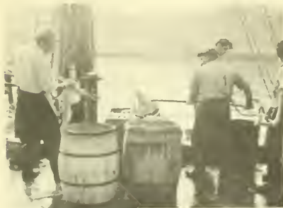
Figure 7.--Pitchforks puncture the fish flesh and contribute to lowering its quality.

Methods of handling fish both on the boat and at the wharf have remained substantially unchanged in the New England area for over 50 years. Many of these handling methods contribute to increased operating costs and to decreased product quality. For example, the use of harbor water in scrubbing down penboards and hold surfaces may add more spoilage bacteria than it removes, and can contribute to spoilage of the next load of fish placed in the vessel's hold. Also, pitchforks now used in unloading fish may result in tearing of the flesh with consequent loss of quality.