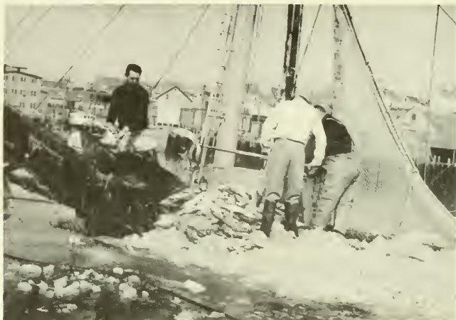
Figure 9.--The pitchfork method of de-icing haddock.

Boston trawlers have installed this equipment, and inquiries concerning its availability and cost have been received from all over the world.