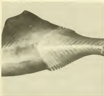
Figure 13.--X-ray picture showing bony structure of fish.

studies have been conducted using several devices. A special xicon television-type tube and various photocells have been used with little success to measure the change in intensity of X-rays emanating from the product when it is exposed to a gamma ray source. Unfortunately when using these methods, it was not possible to electrically define what little resolution was obtained.