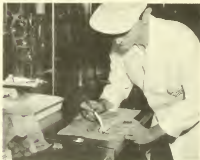
Figure 15.--Inspector grading fish sticks.

A few statistics will show how inspection has progressed. From July 1958 through June 1959, the number of plants in this region packing fishery products under the Department's Continuous Inspection Service increased from six to eight. During this same period the number of USDI inspectors increased from 8 to 14. Also, more than 40 million pounds of fishery products were packed under the continuous inspection program in this area during this period, the greatest part of which displayed the Department's Grade A shield or continuous inspection shield.