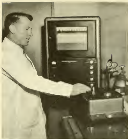
Figure 11.--Determining the spectra of compounds that contribute to the odor and flavor of fish.

Fundamental changes in the order of arrangement of the molecules comprising the protein of the muscle of frozen-