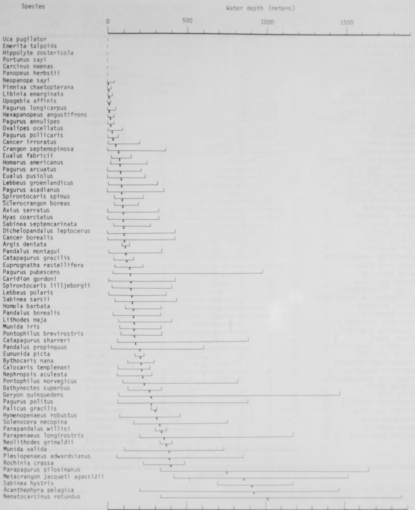
Figure 1.—Ranked bathymetric ranges of selected Decapoda from the northeastern United States represented by data in the NMFS Woods Hole collection.